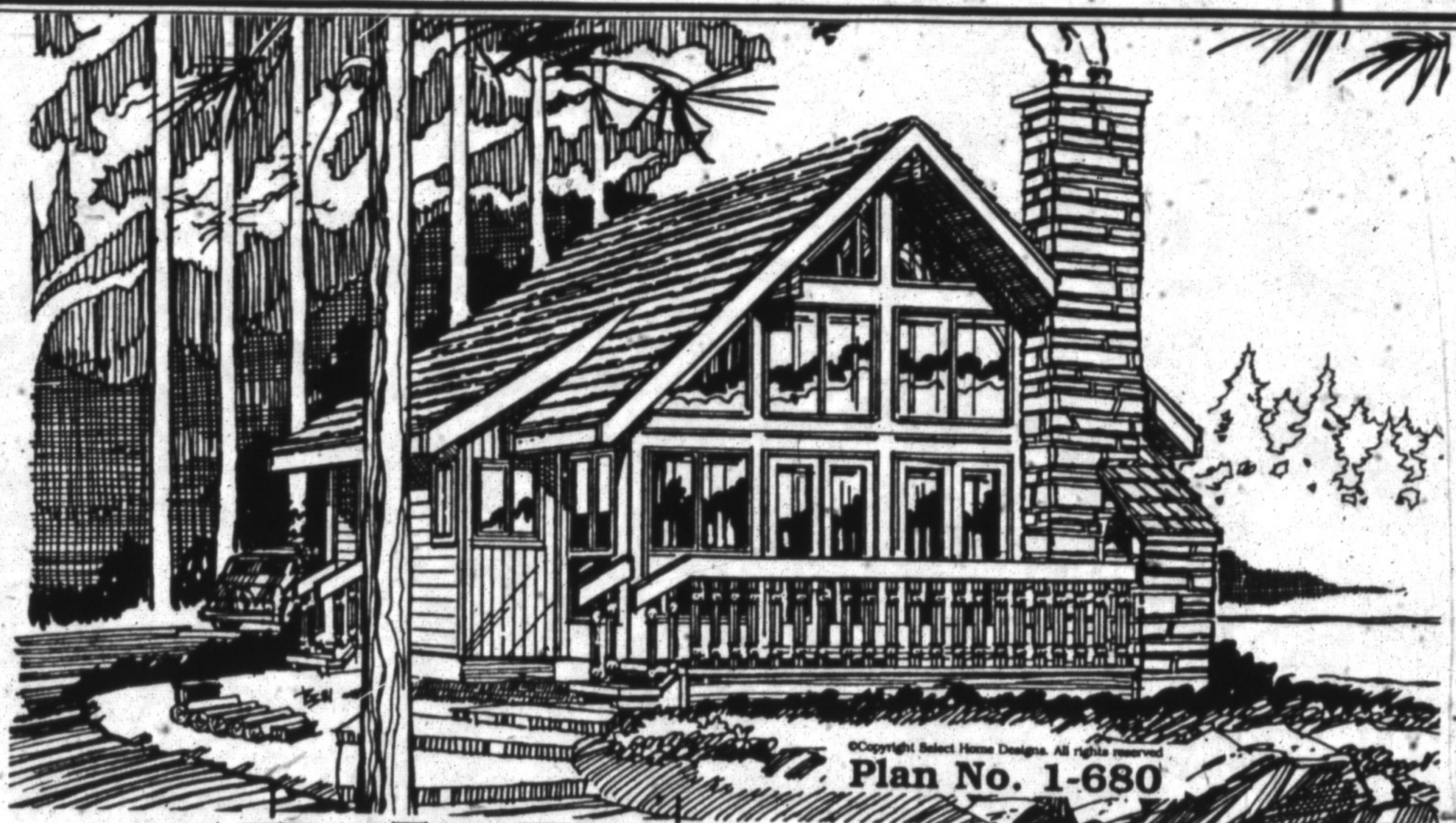
Plan No. 1-680

To receive a 300-page plan book for only $9.95 (including shipping and GST) featuring this design and more than 400 other beautifully illustrated home and cottage designs, call toll-free 1-800-663-6739, fax (604) 251-3212, or e-mail to: selecthomedesigns@msc.com. (specify The Canadian Champion). We accept VISA / MasterCard / AMEX. For payment via cheque or money order, make payable to Design for Living, c/o The Canadian Champion, send to #301, 611 Alexander Street, Vancouver, B.C., V6A 1E1.