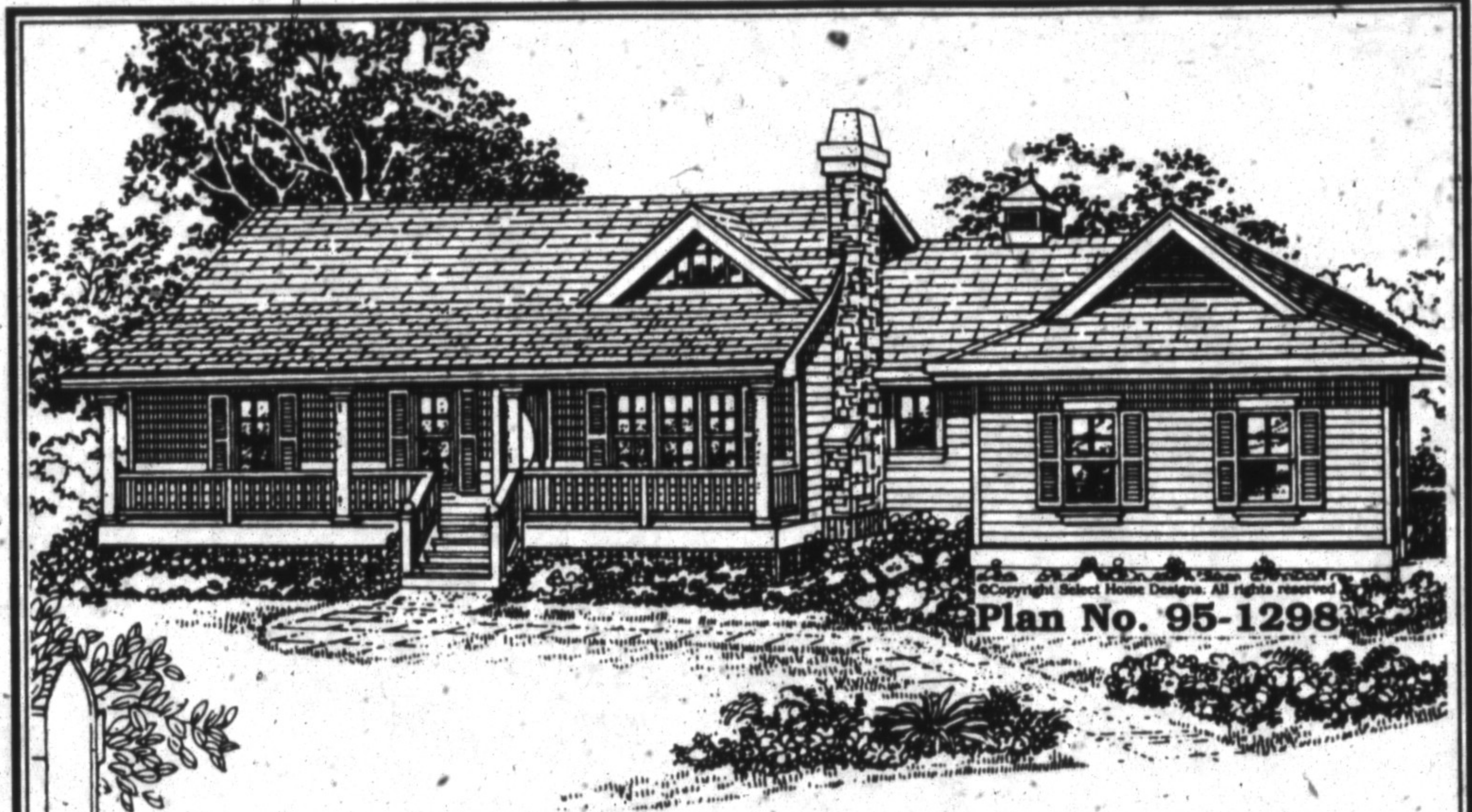
Plan No. 95-1298