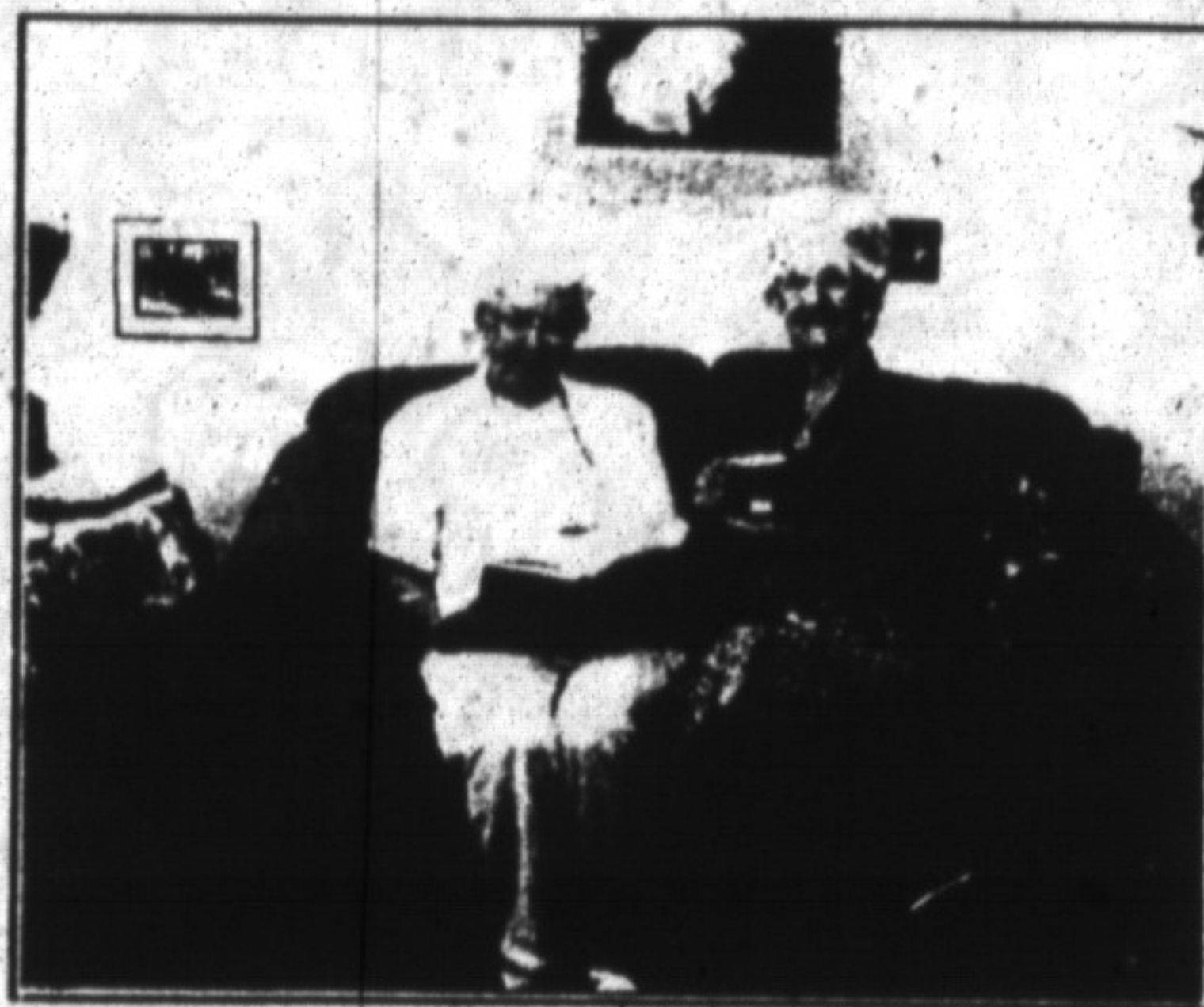
Enjoy a Tour & Tea at Heritage House

With best wishes for a healthy and happy new year!