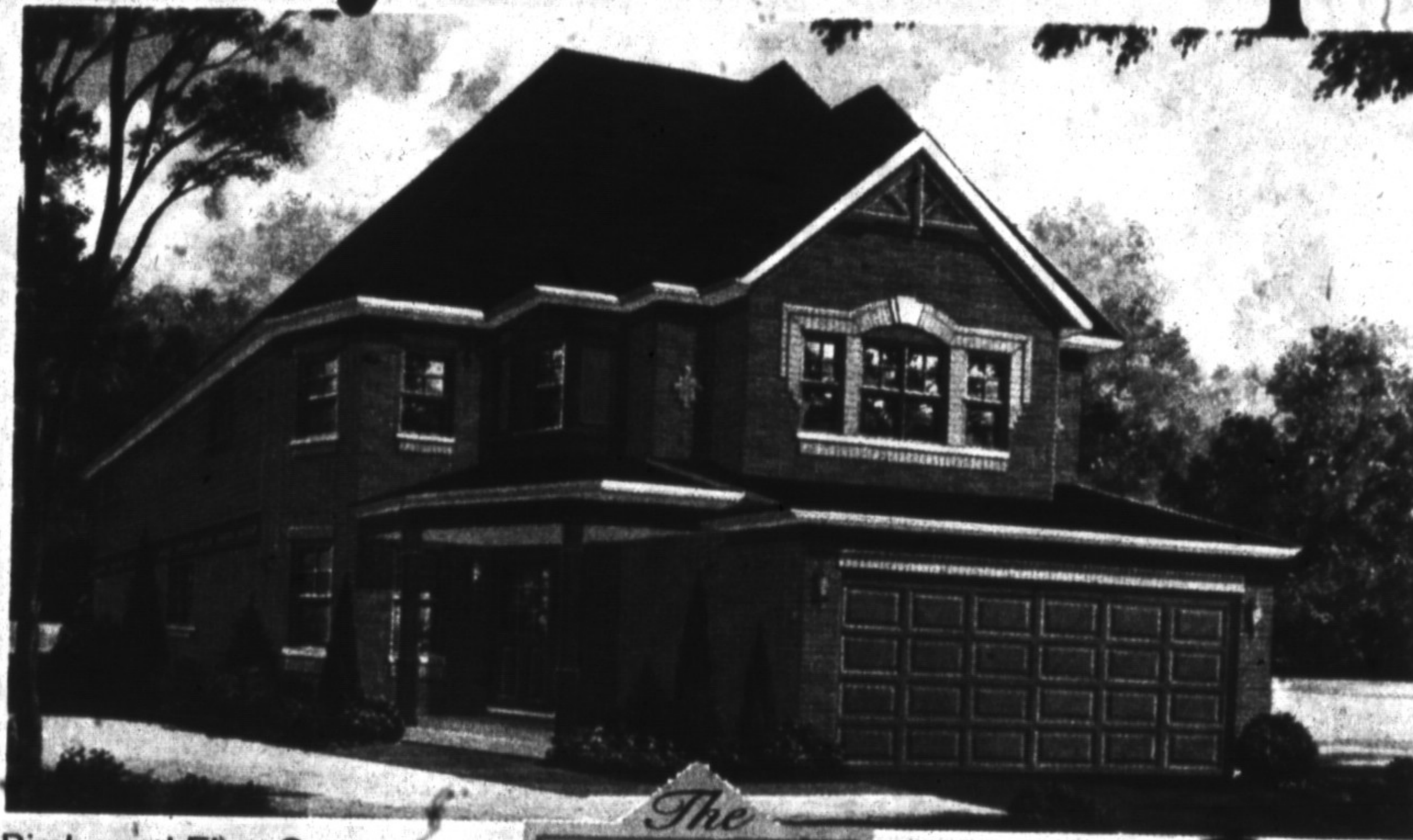
Birchwood Elev. C 2225 Sq. Ft. $207,900