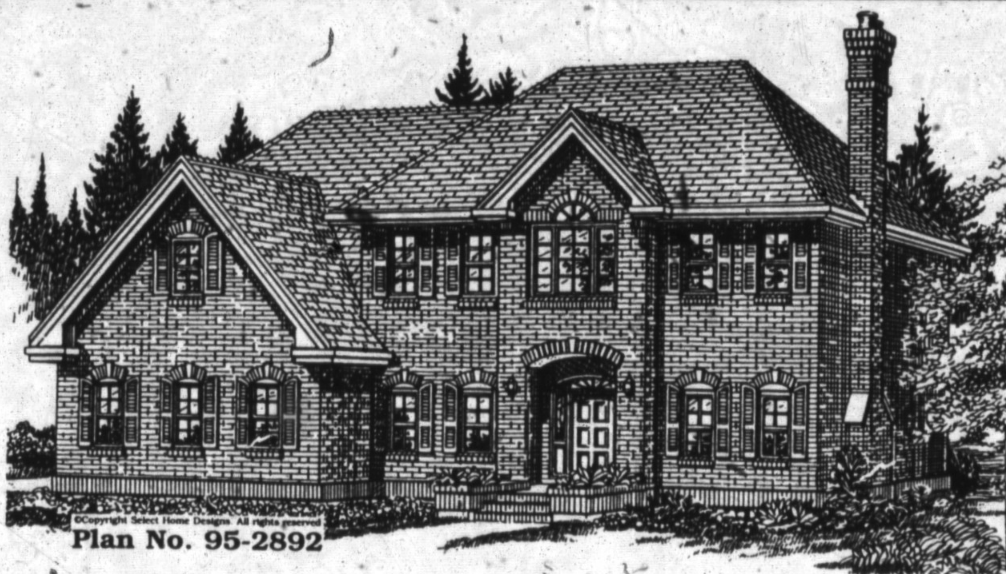
Plan No. 95-2892

To receive a 300 page plan book for only $9.95 (including shipping and GST) featuring this design and more than 400 other beautifully illustrated home and cottage designs, call 1-800-663-6739, fax (604) 251-3212 or e-mail to: selecthomedesigns@msn.com (specify newspaper name). We accept Visa/Mastercard/AMEX. For payment via cheque or money order, make payable to Design for Living, c/o this newspaper, send to #301, 611 Alexander Street, Vancouver, B.C., V6A 1E1.