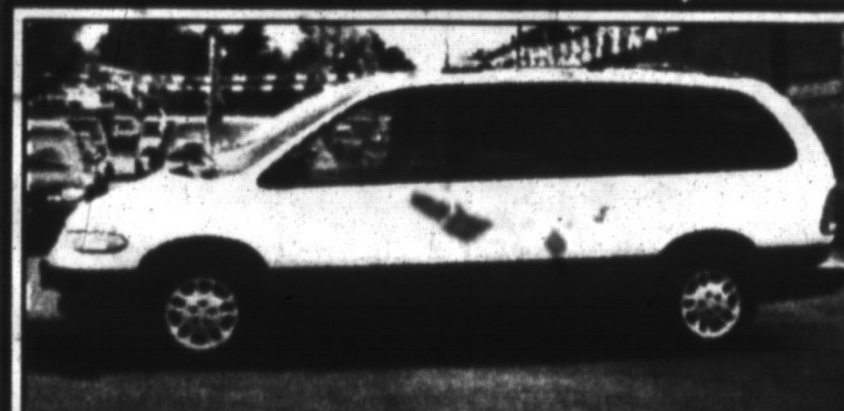
1996 GRAND CARAVAN LE

One owner. Loaded, loaded. Priced to sell.