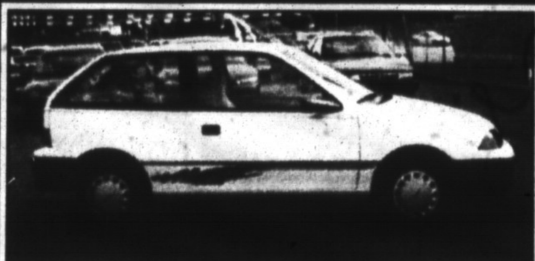
1994 GEO METRO

The gas miser! Auto, AM/FM, 2 door. Great run about.