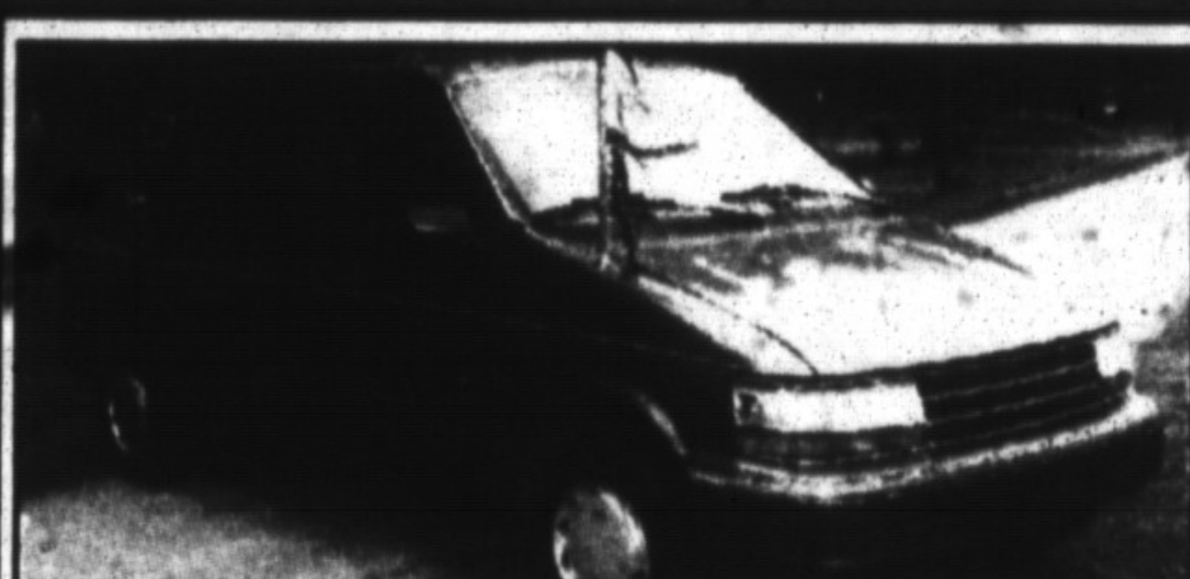
1992 PLYMOUTH VOYAGER

Several to choose from. This one in immaculate condition, just waiting for the opportunity of serving its new owner, as it did the original owner.