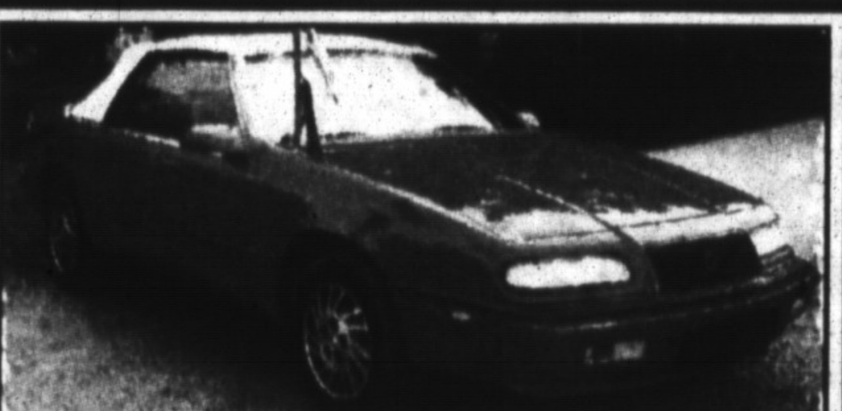
1994 CHRYSLER LEBARON CONV. GTC

Still lots of time to drive, with the top down, and still laugh at the winter snows with the top up. Don't miss this one.