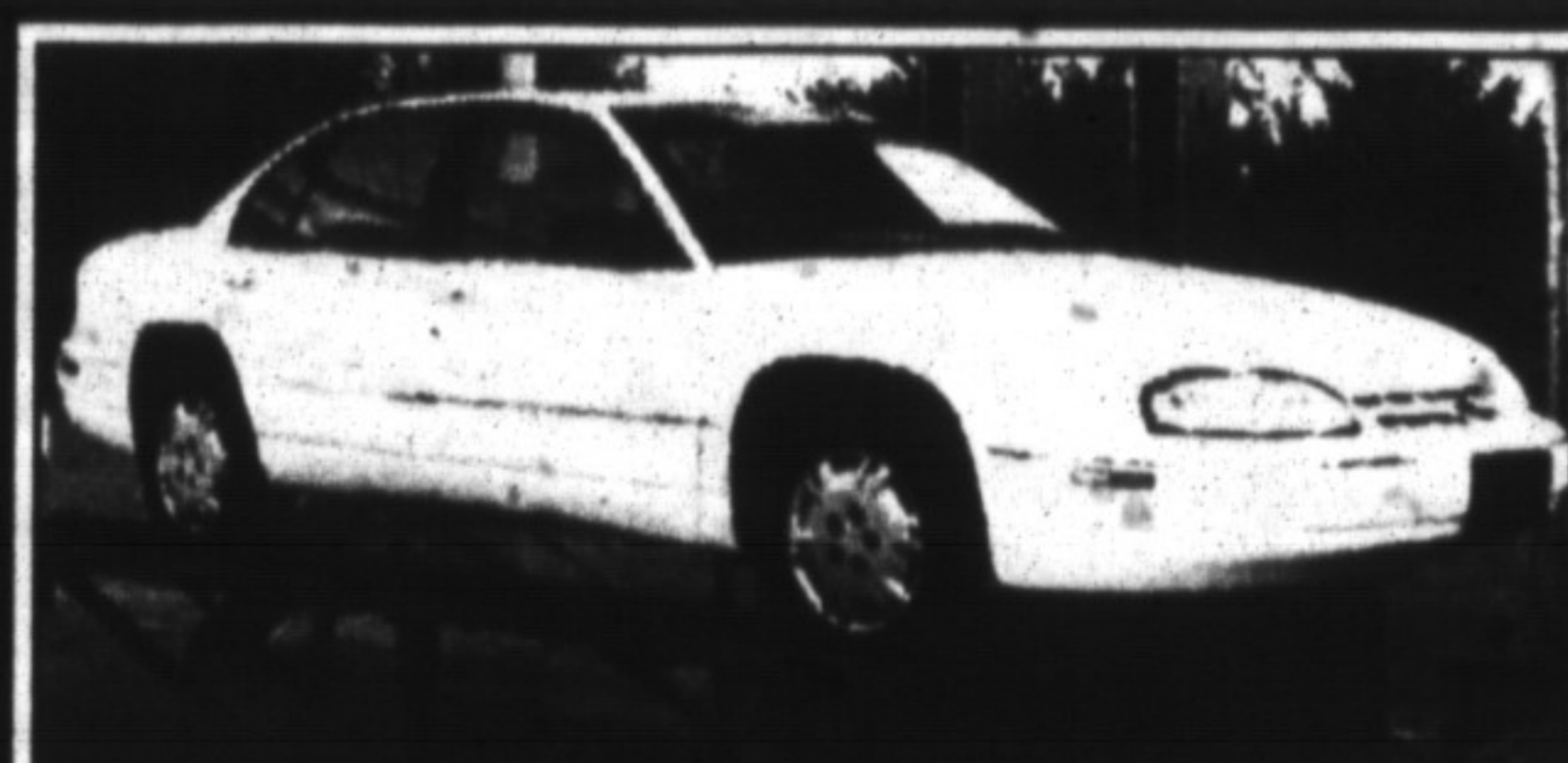
1996 LUMINA 4 DOOR

V6 engine, auto O/D, P/windows, P/door locks, tilt, cruise, air cond., AM/Fm cassette, 60/40 seats, white with blue interior. Balance of factory warranty. Stock #P1524.