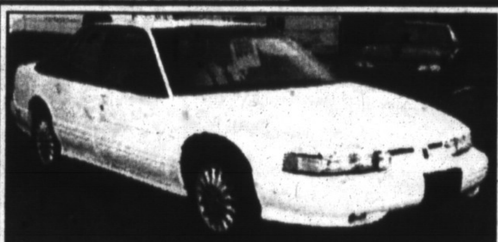
1996 CUTLASS SUPREME SL 4 DR.

V6 engine, auto O/D, P/windows, P/door locks, cruise, tilt, AM/FM cassette, air condition, AM/FM cassette, 60/40 seats. Balance of new car warranty. Stock #1525.