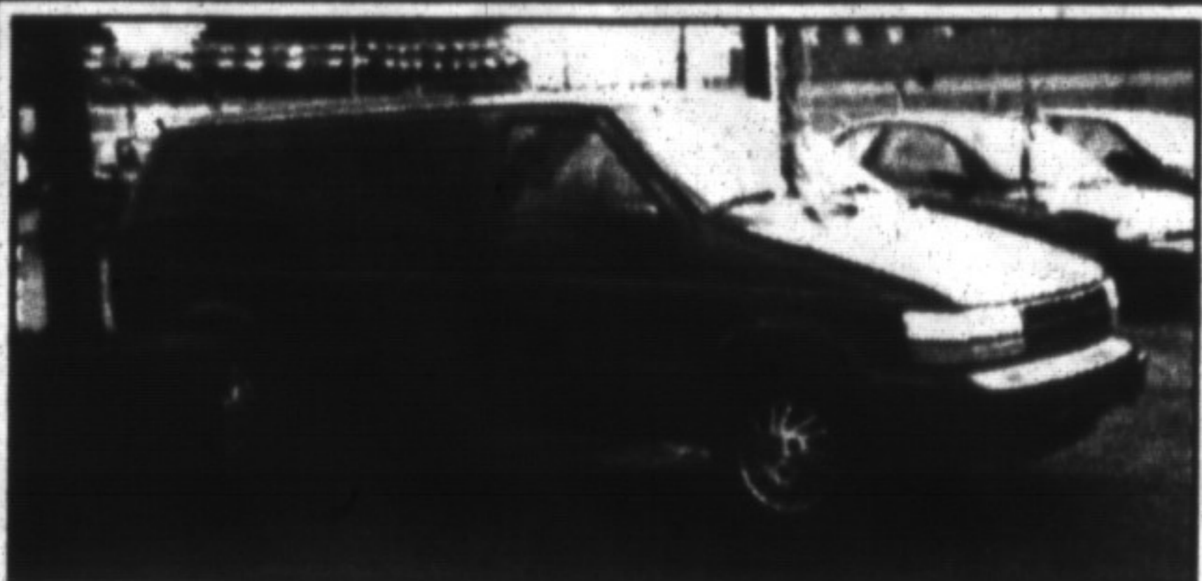
1995 GRAND CARAVAN SE

Air, tilt, cruise, power windows & locks, overhead console, keyless entry, Like new, a must see!