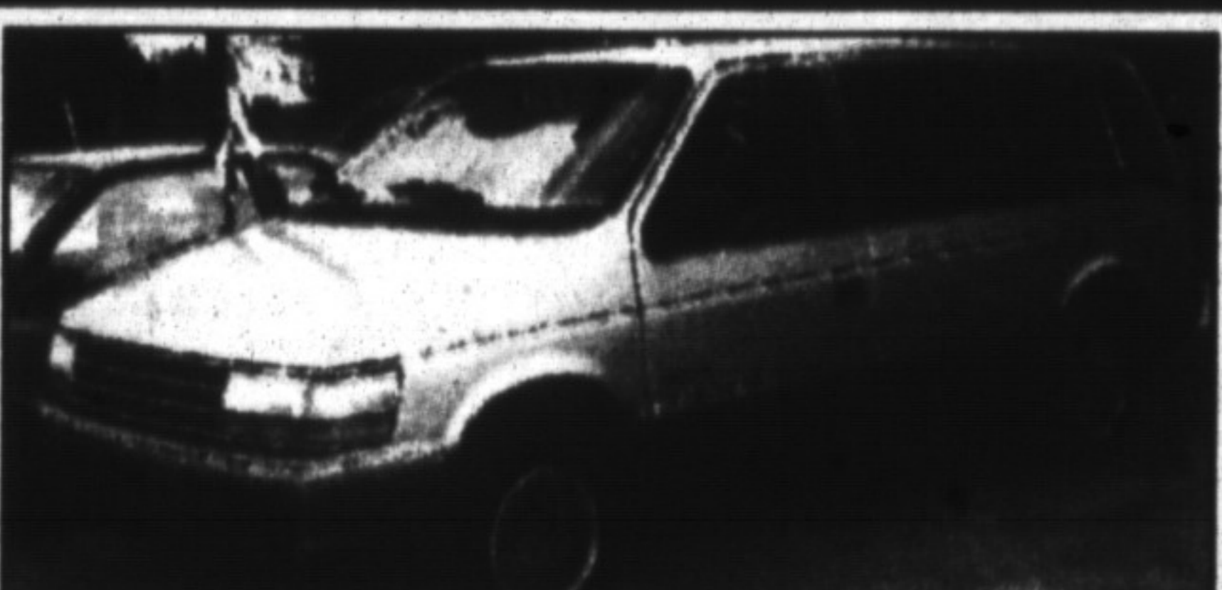
1991 PLYMOUTH GRAND VOYAGER LE