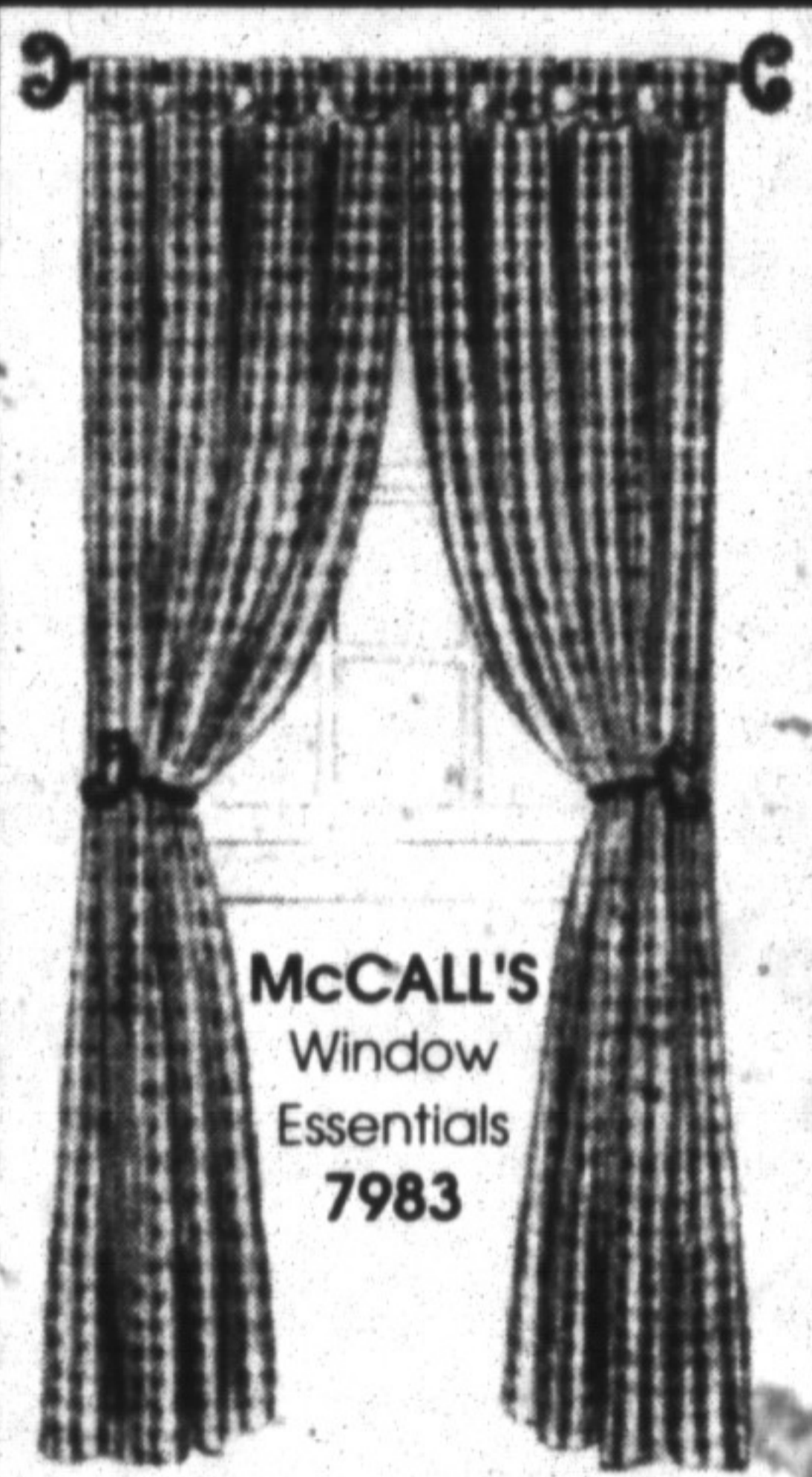
McCALL'S Window Essentials 7983