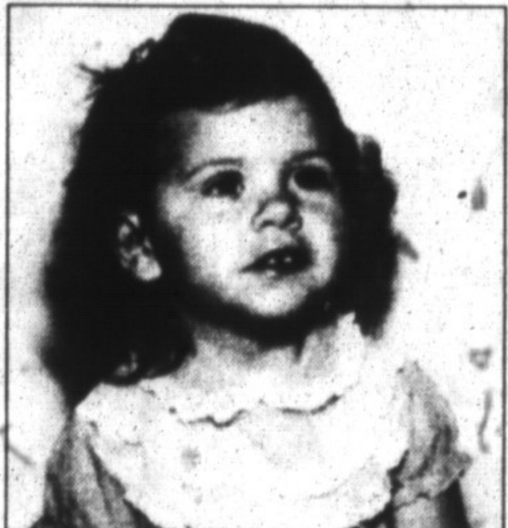
Happy Birthday Love Your Family!