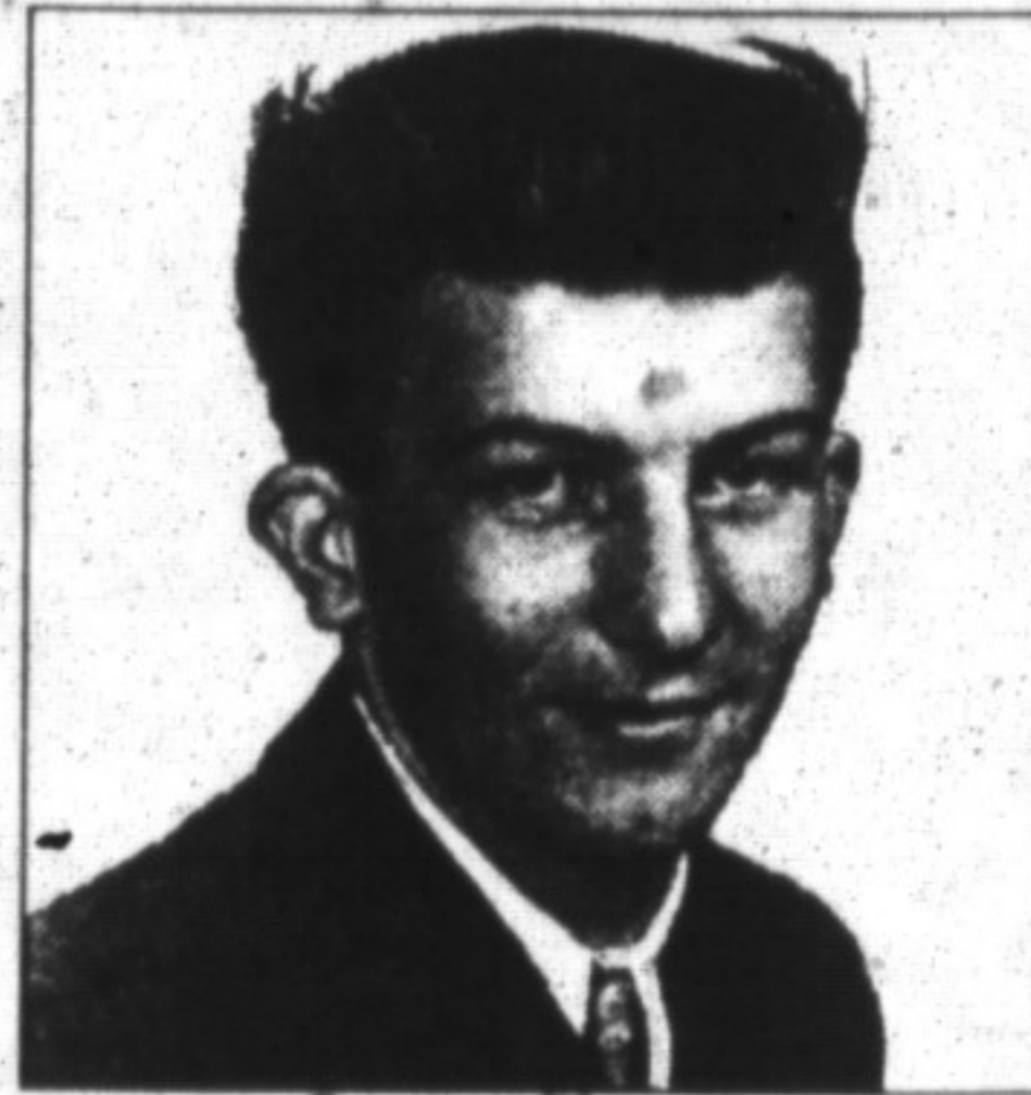
Love From Your Family & Friends!