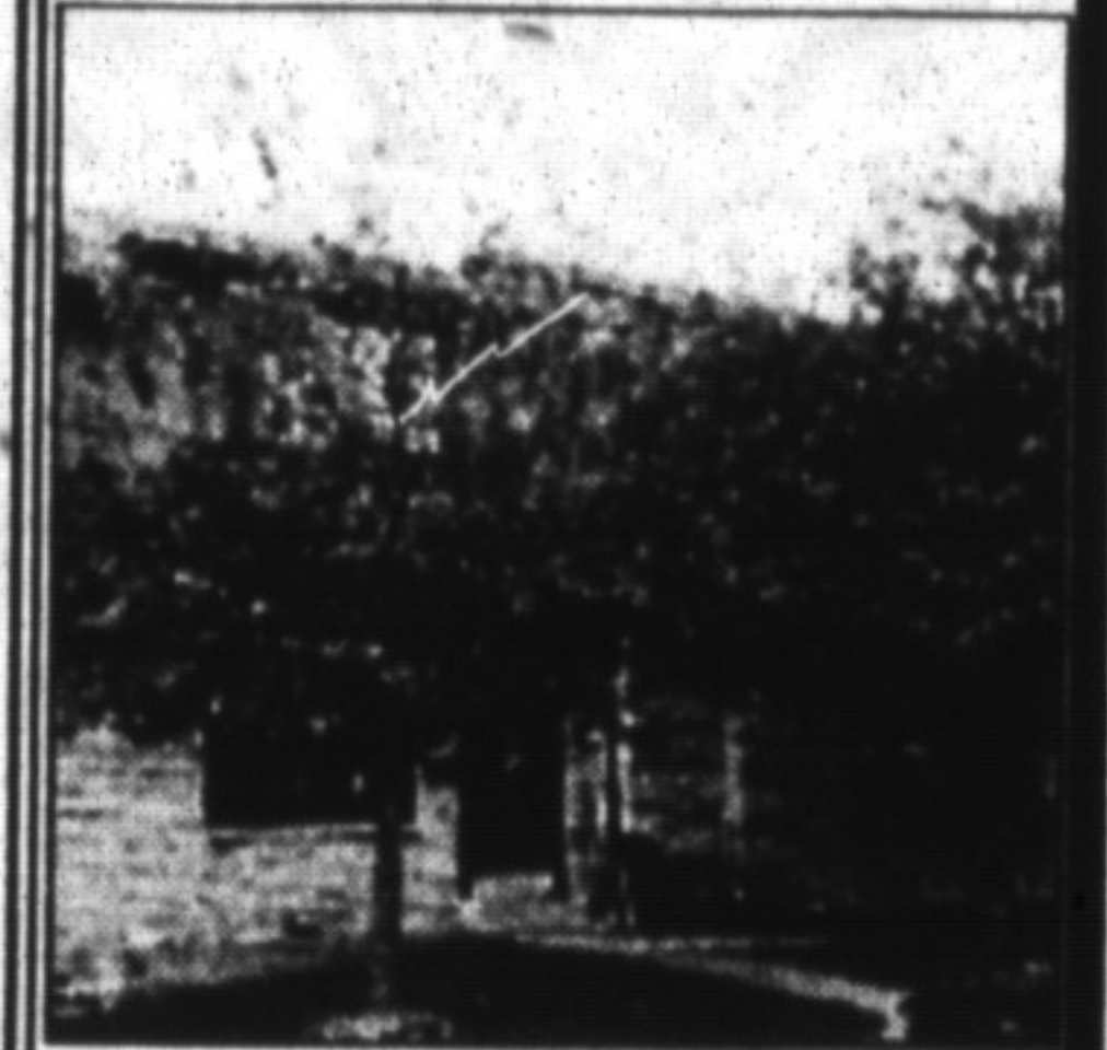
Backs onto Parkland, End Unit, Fully Fenced Yard

OPEN HOUSE 643 Woodward Ave. $109,900. SAT. AUG 10 2-4 PM