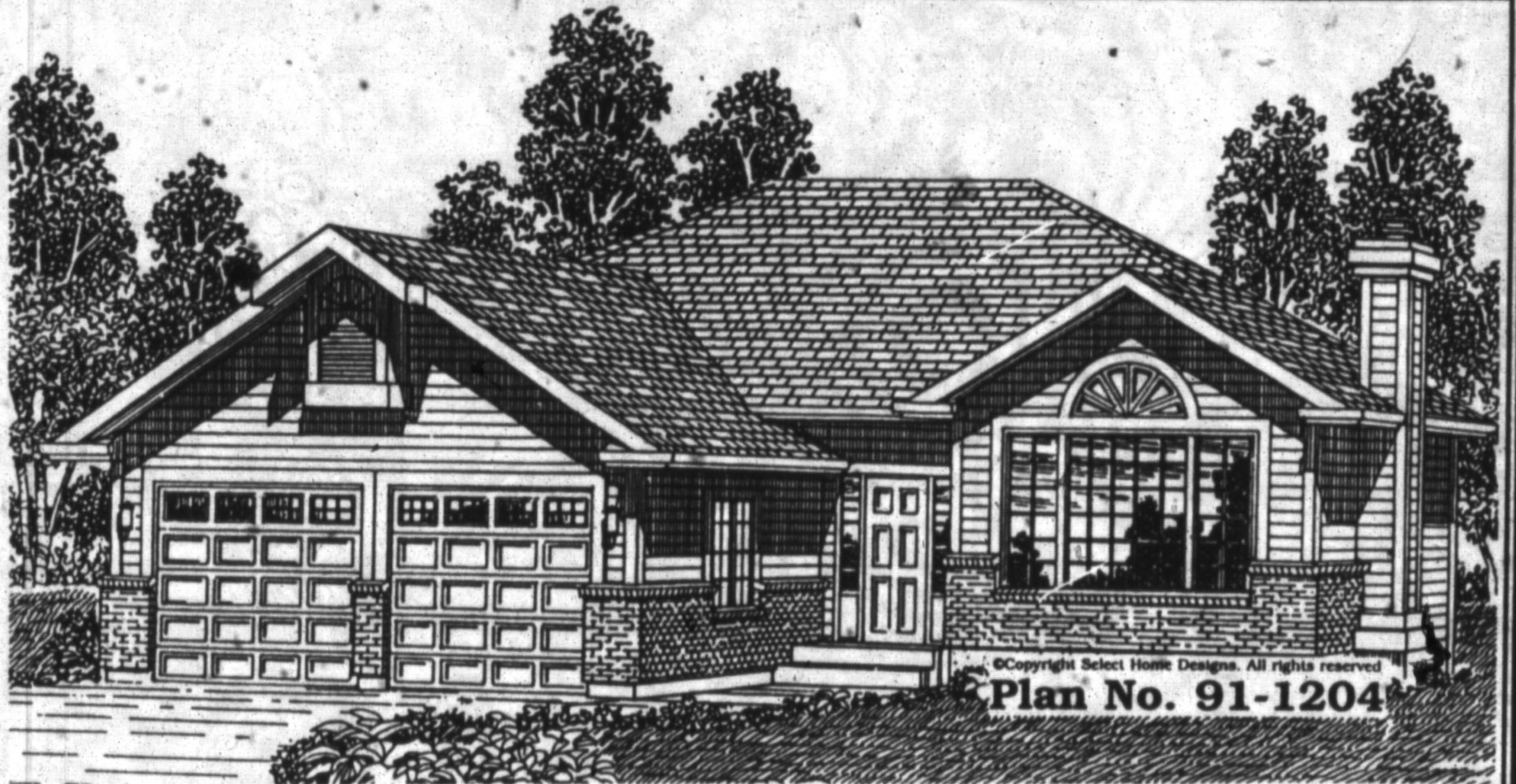
Plan No. 91-1204

Send for Canada's largest plan book with more than 500 home plans, including a wide variety of architectural styles from luxurious brick manors to affordable bungalows, only $9.95 (including shipping and GST). To order using VISA or MasterCard, call toll-free 1-800-663-6739, fax (604) 251-3212, or send cheque or money order to Design for Living, c/o The Canadian Champion, #301, 611 Alexander Street, Vancouver, B.C., V6A 1E1. Trained consultants are standing by Monday to Saturday to take your order for the plan book, or to provide information about the plan featured in this column.