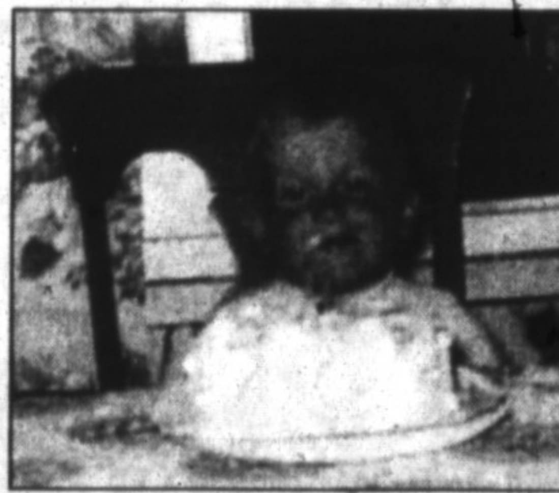
Love Your Family