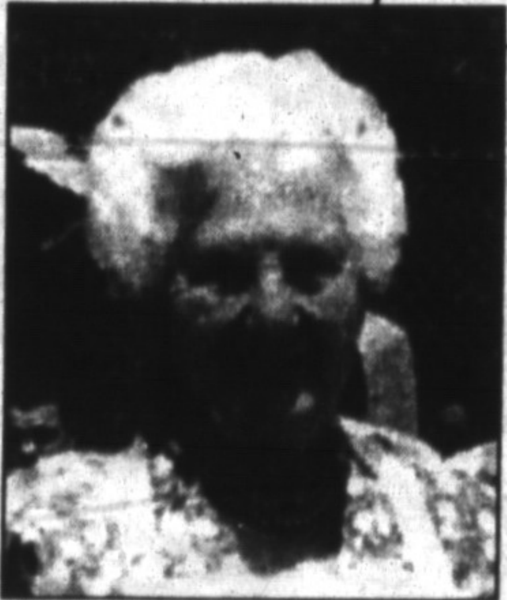
Love from The Family