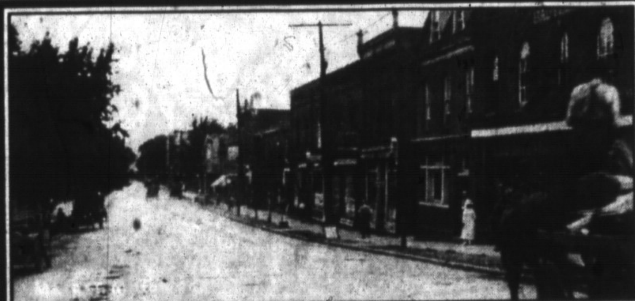
(Moonlight Magic circa 1920)

We apologize for any inconvenience that this may cause.