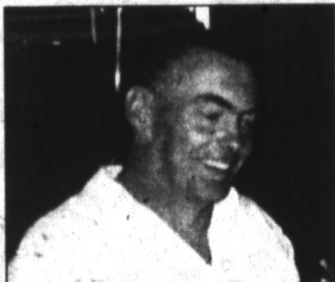
You're The Greatest!