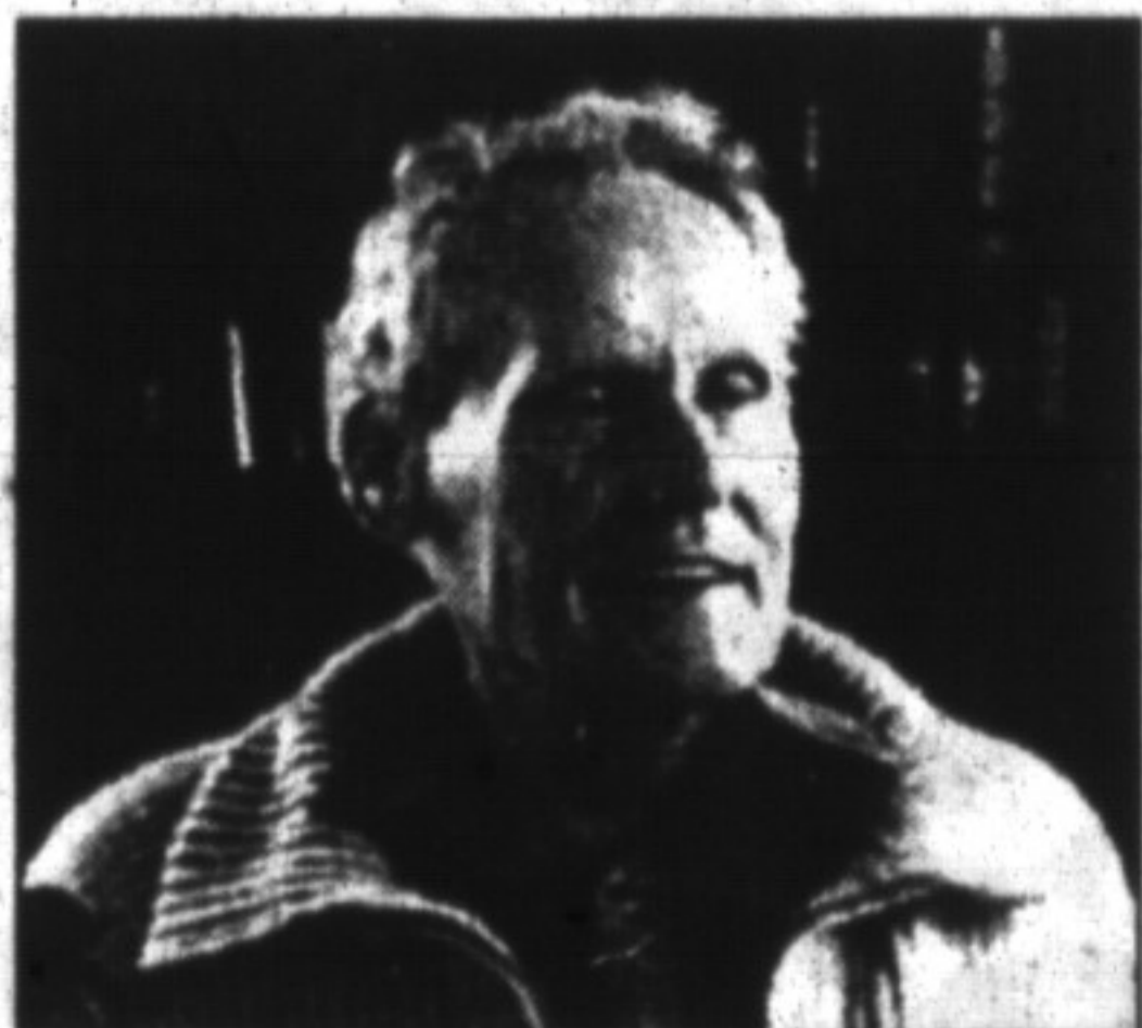
Love From: The Family