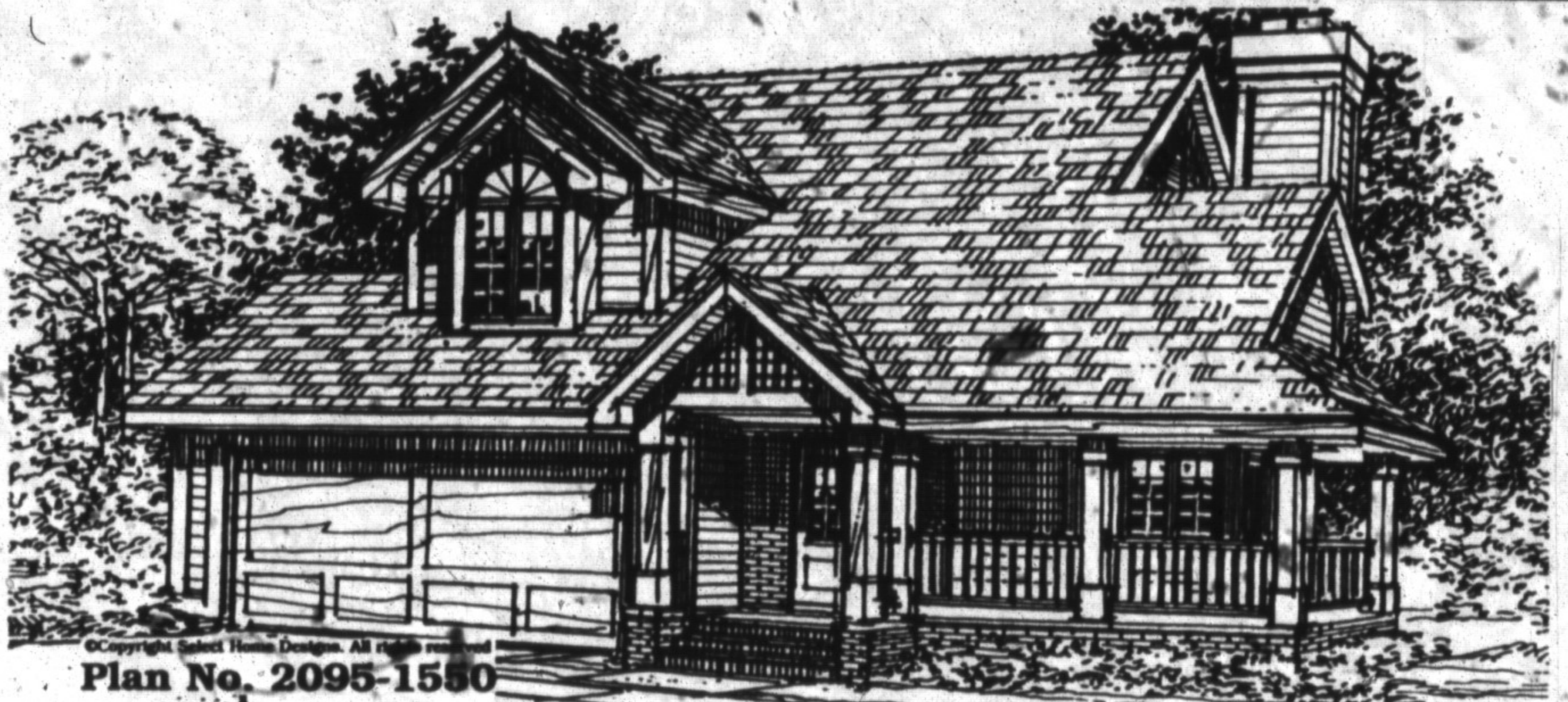
Plan No. 2095-1580

Send for Canada's largest plan book with more than 300 home plans, including a wide variety of architectural styles from luxurious brick manors to affordable bungalows, only $9.95 (including shipping and GST). To order using VISA or MasterCard, call toll-free 1-800-663-6739, fax (604) 251-3212, or send cheque or money order to Design for Living, c/o The Canadian Champion, #301, 611 Alexander Street, Vancouver, B.C., V6A 1E1. Trained consultants are standing by Monday to Saturday to take your order for the plan book, or to provide information about the plan featured in this column.