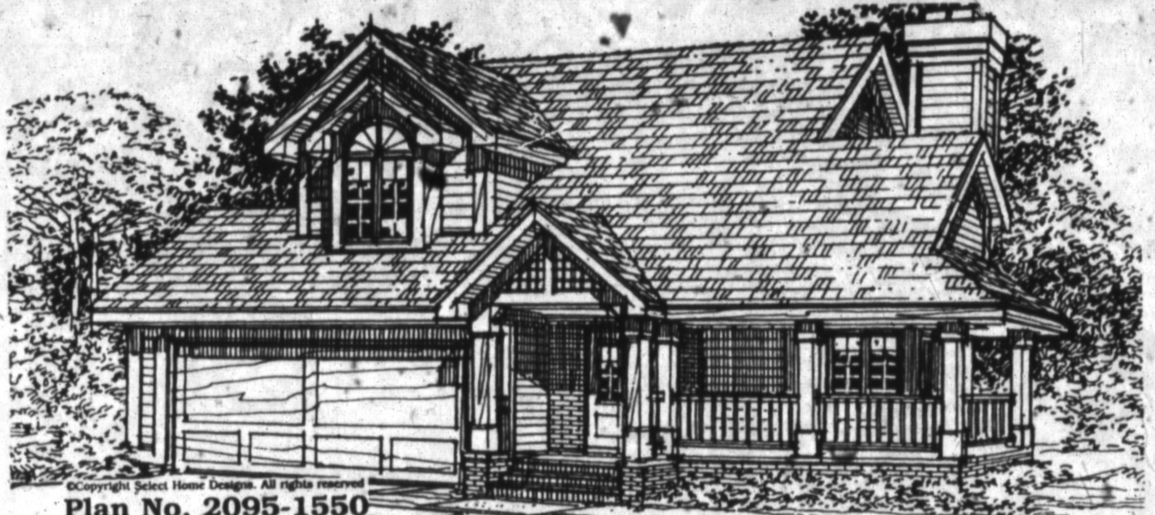
Plan No. 2095-1550

Send for Canada's largest plan book with more than 300 home plans, including a wide variety of architectural styles from luxurious brick manors to affordable bungalows, only $9.95 (including shipping and GST). To order using VISA or MasterCard, call toll-free 1-800-663-6739, fax (604) 251-3212, or send cheque or money order to Design for Living, c/o The Canadian Champion, #301, 611 Alexander Street, Vancouver, B.C., V6A 1E1. Trained consultants are standing by Monday to Saturday to take your order for the plan book, or to provide information about the plan featured in this column.