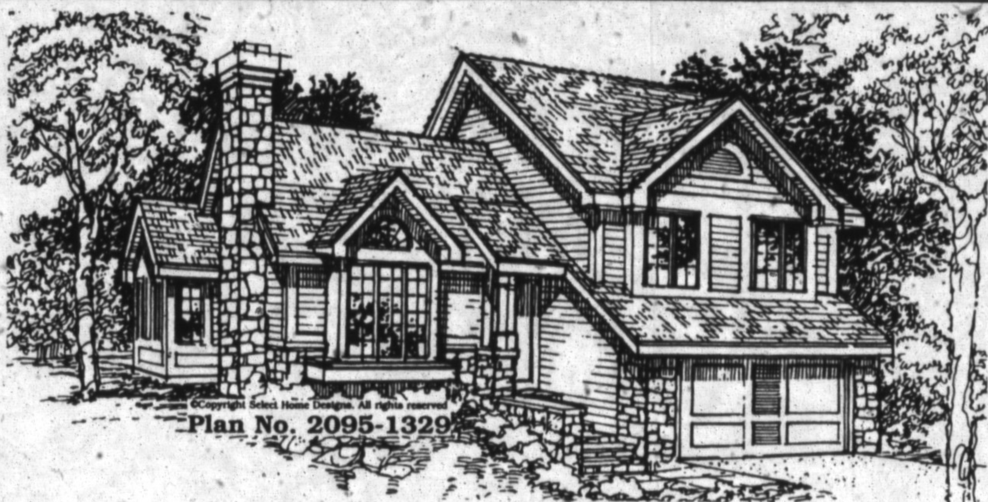
Plan No. 2095-1329