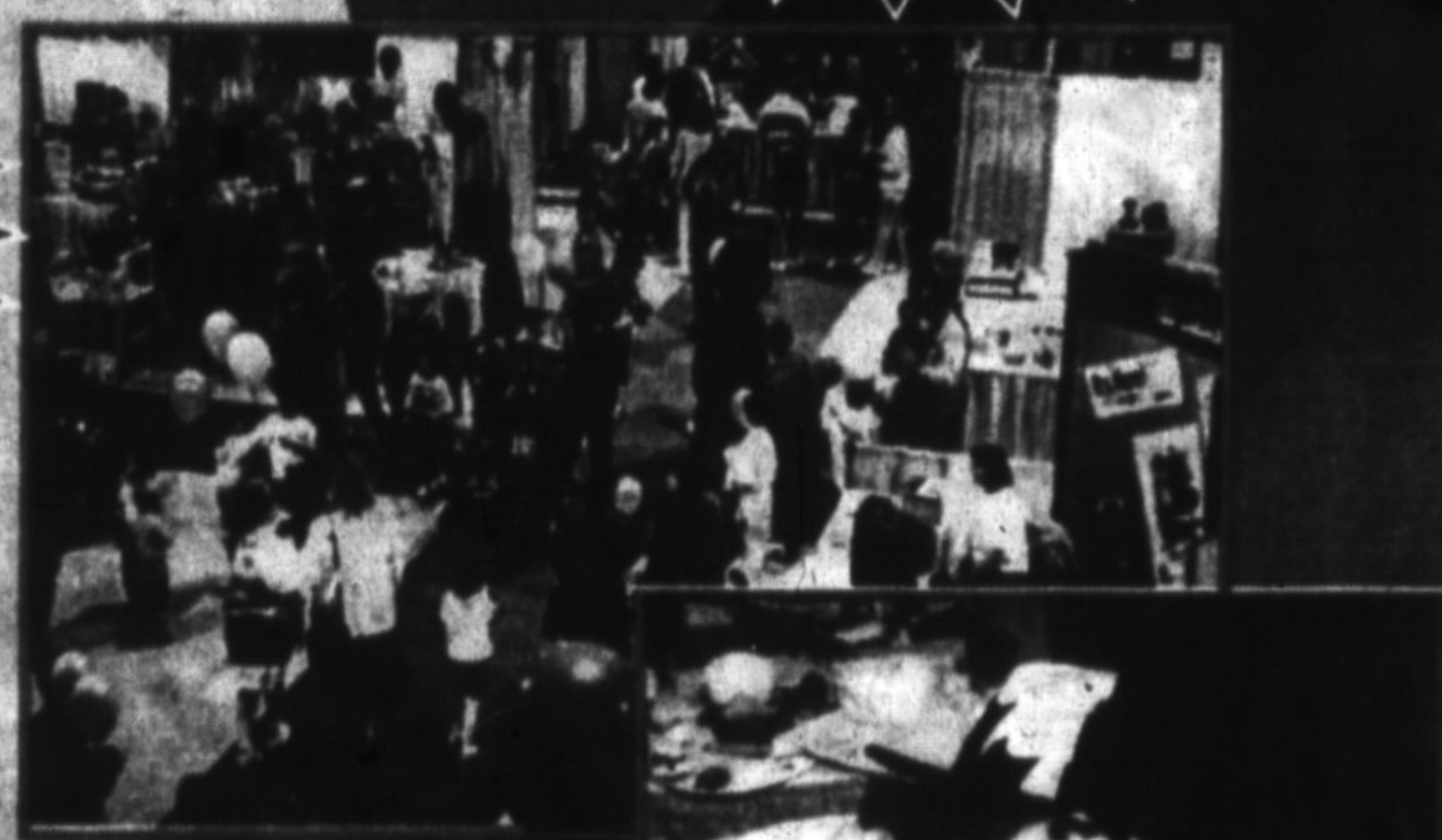
FREE Face Painting and Balloons when you visit SQUEAKY THE CLOWN!