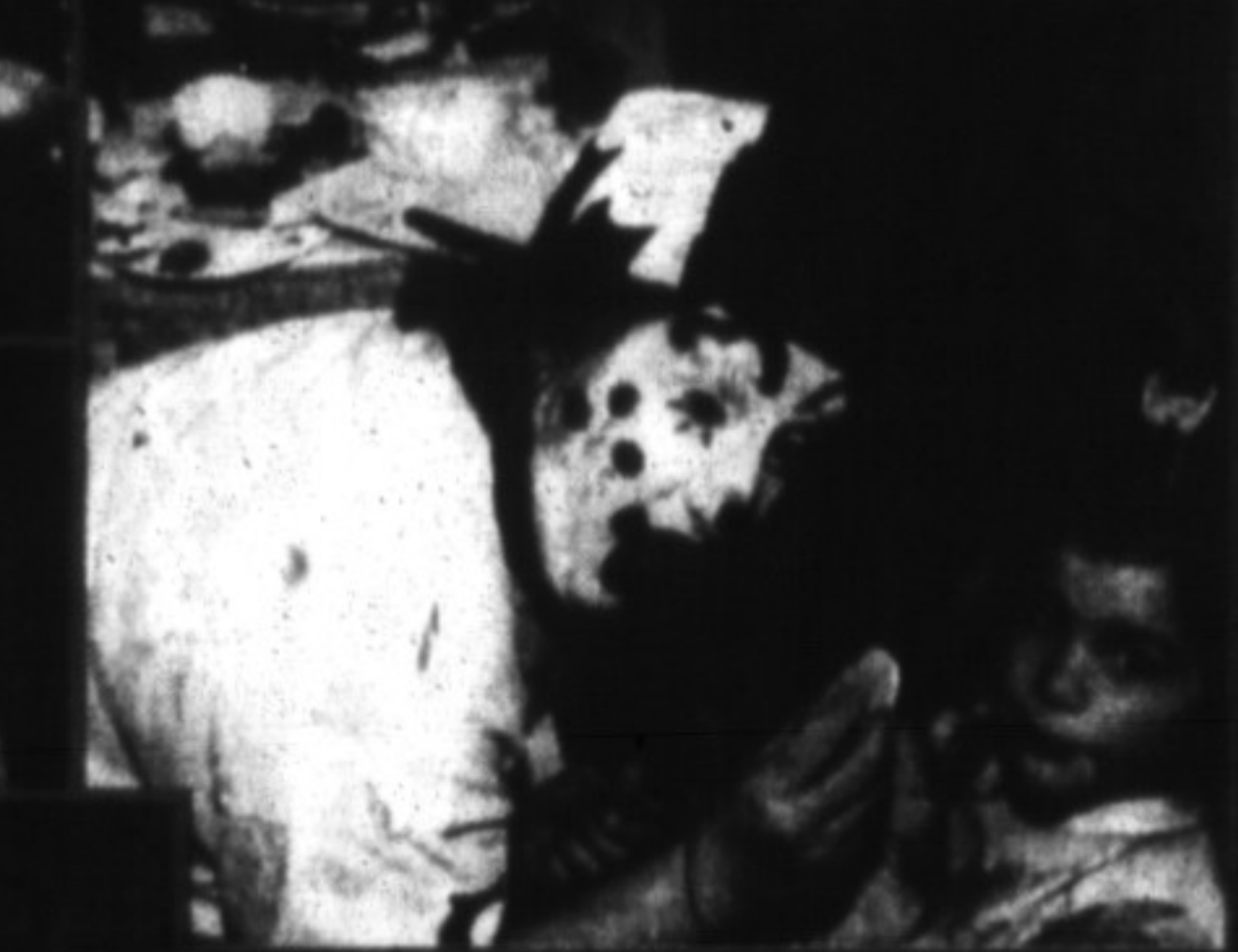
LOTS OF FUZZY FRIENDS As well as: • Sailor Moon • Jake from the Lake • "Barney" and more!