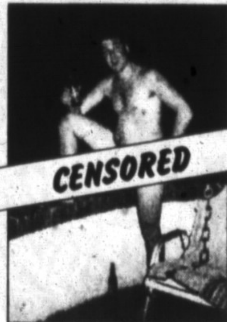
You can BANK on it!

Happy Birthday To our favourite 18-year-old