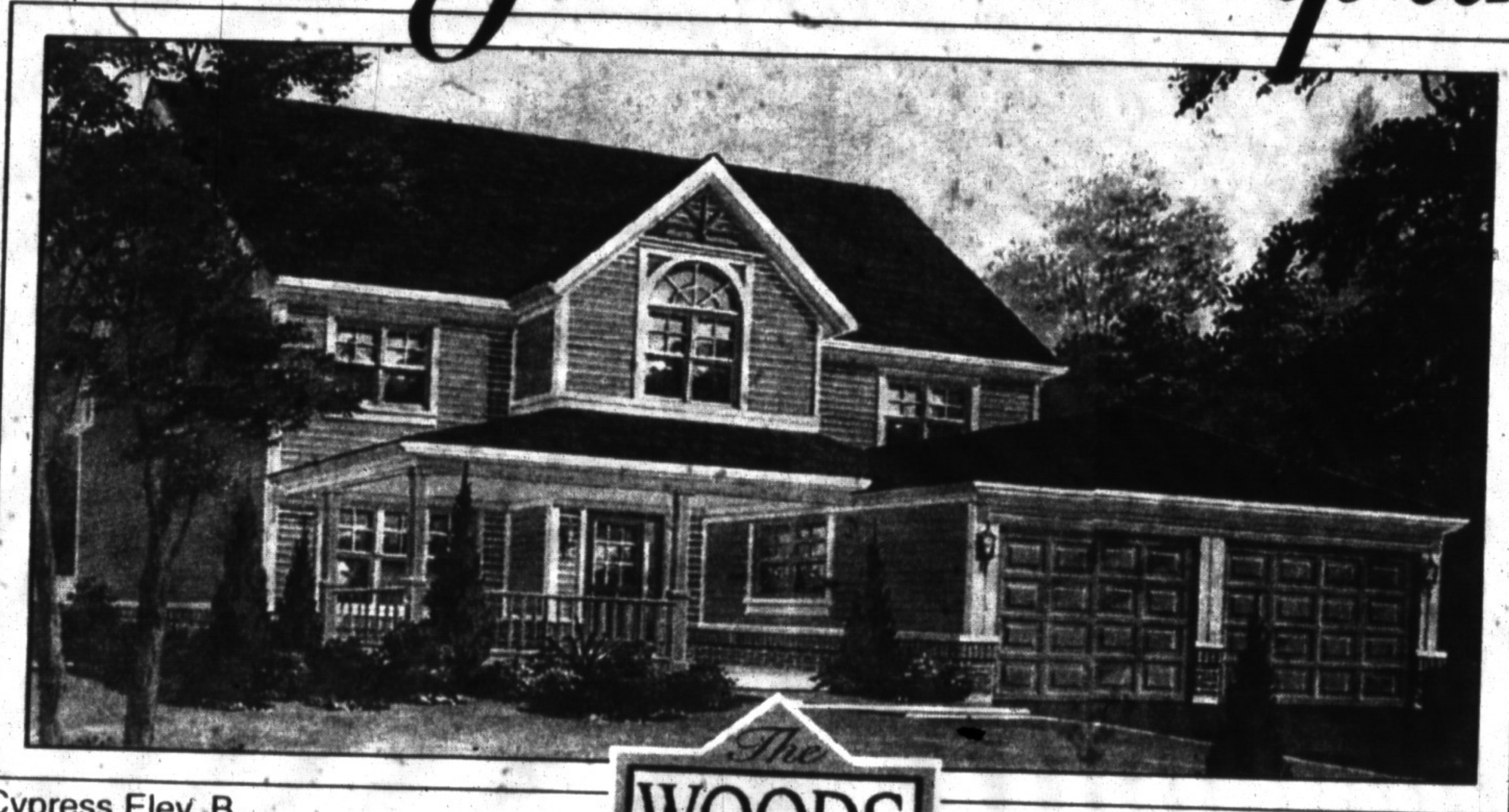
Cypress Elev. B 1815 sq. ft. $195,900

Bungalows and 2 Storey Homes up to 3505 sq. ft.