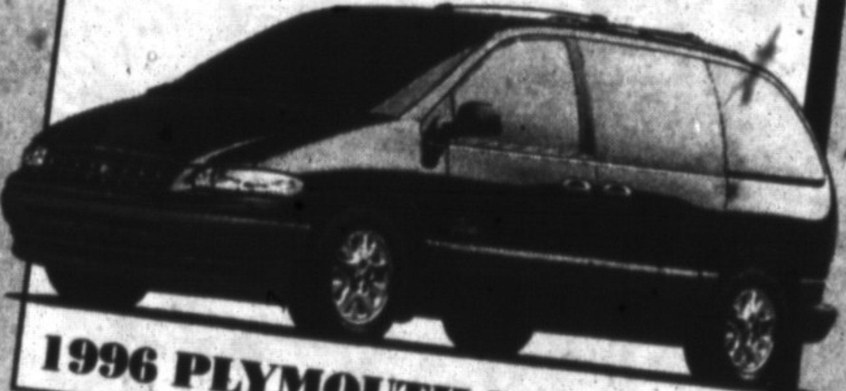
1996 PLYMOUTH VOYAGER