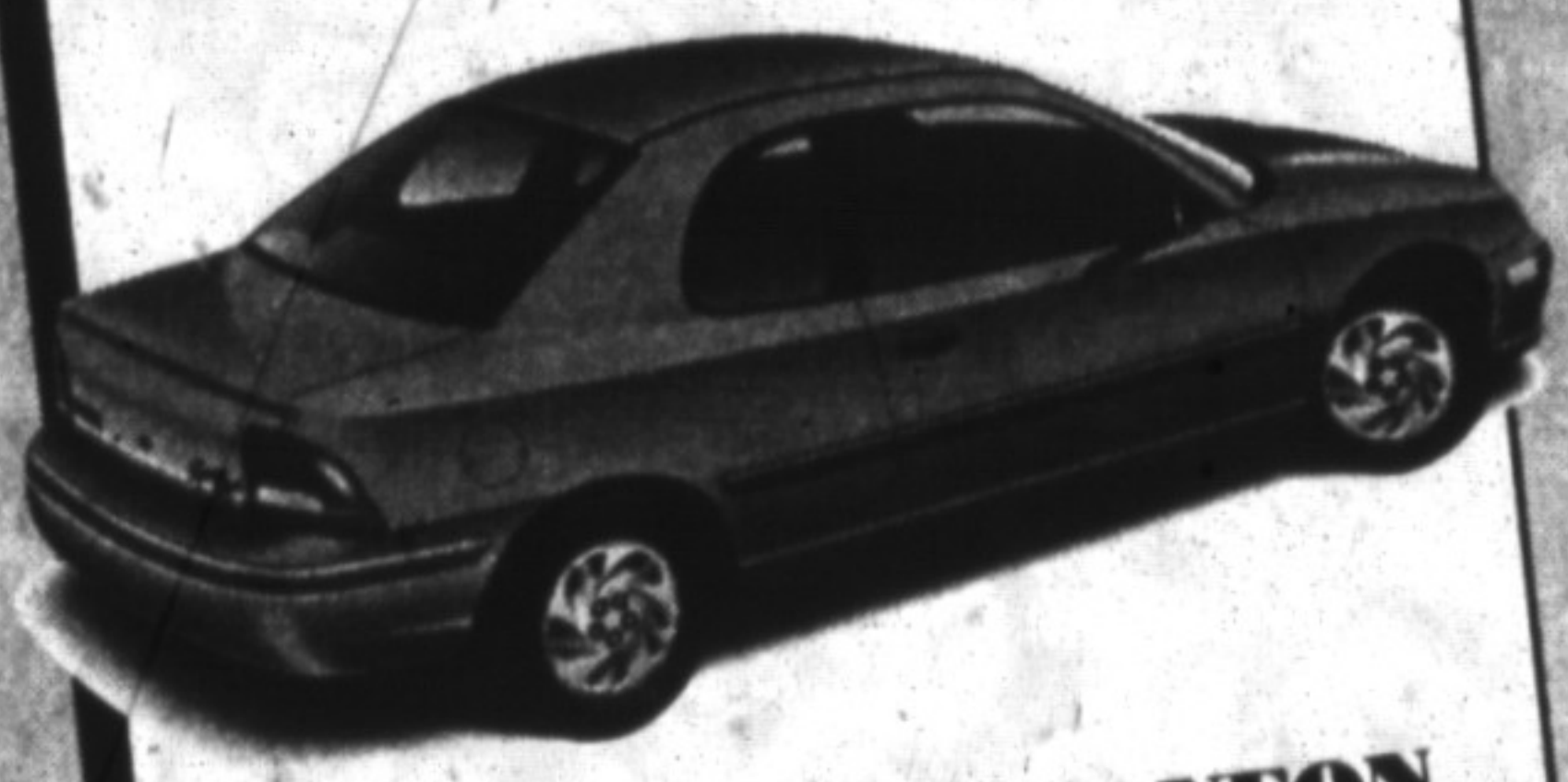
1996 PLYMOUTH NEON