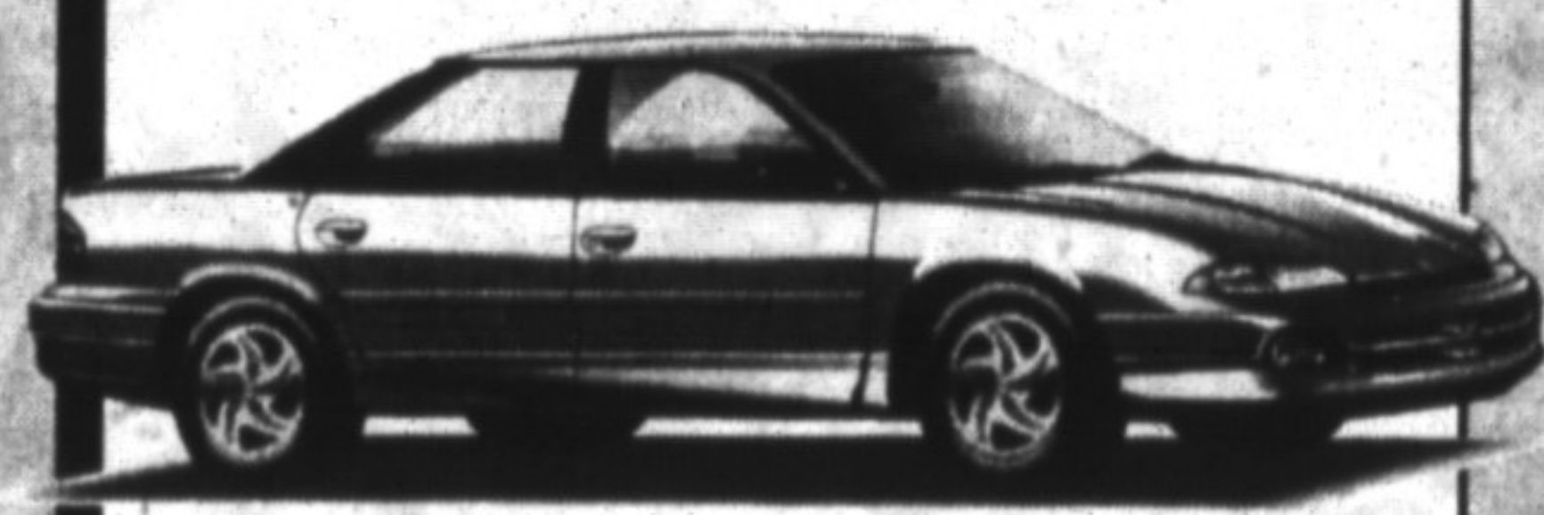
1996 CHRYSLER INTREPID