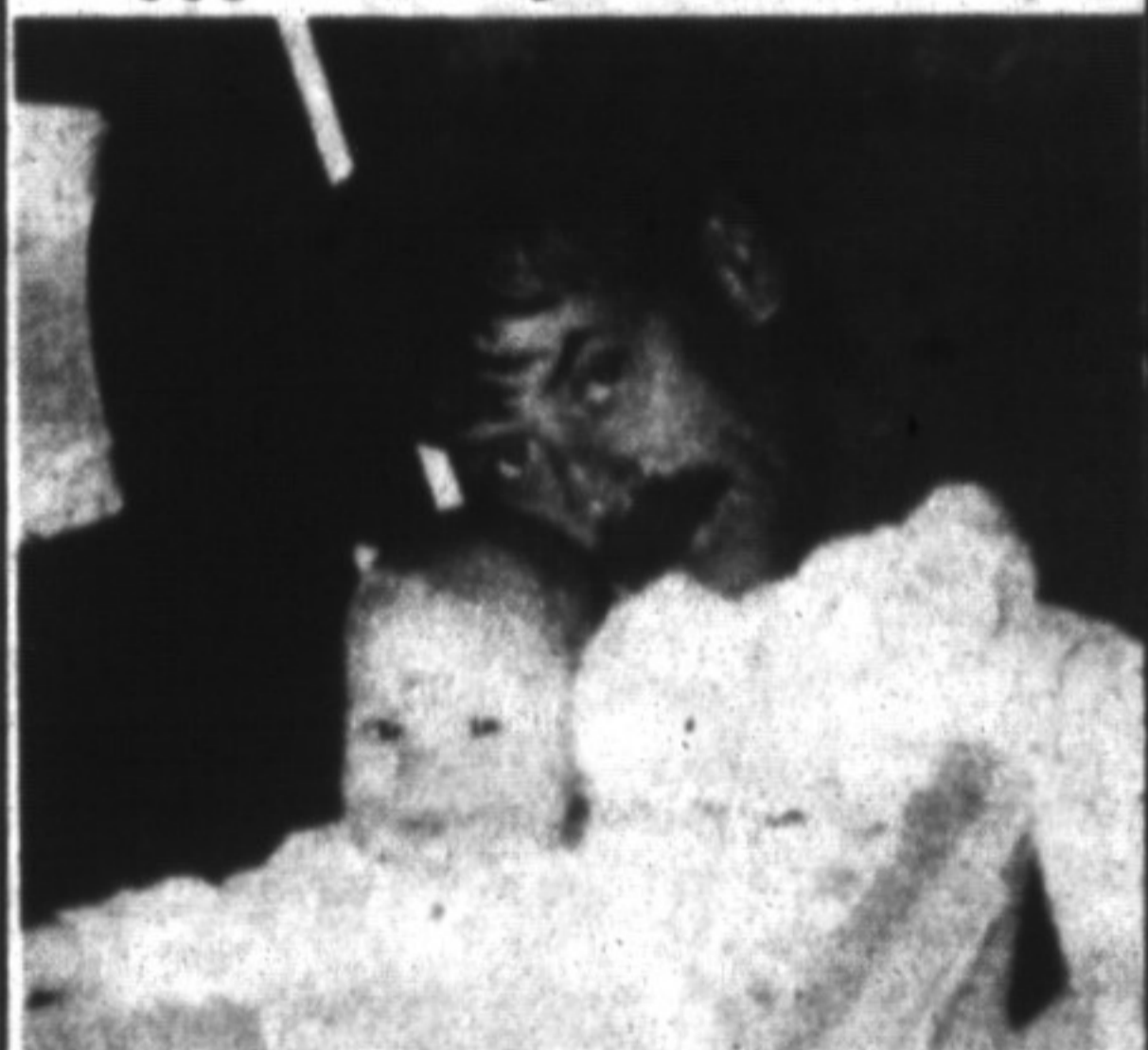
Love your family