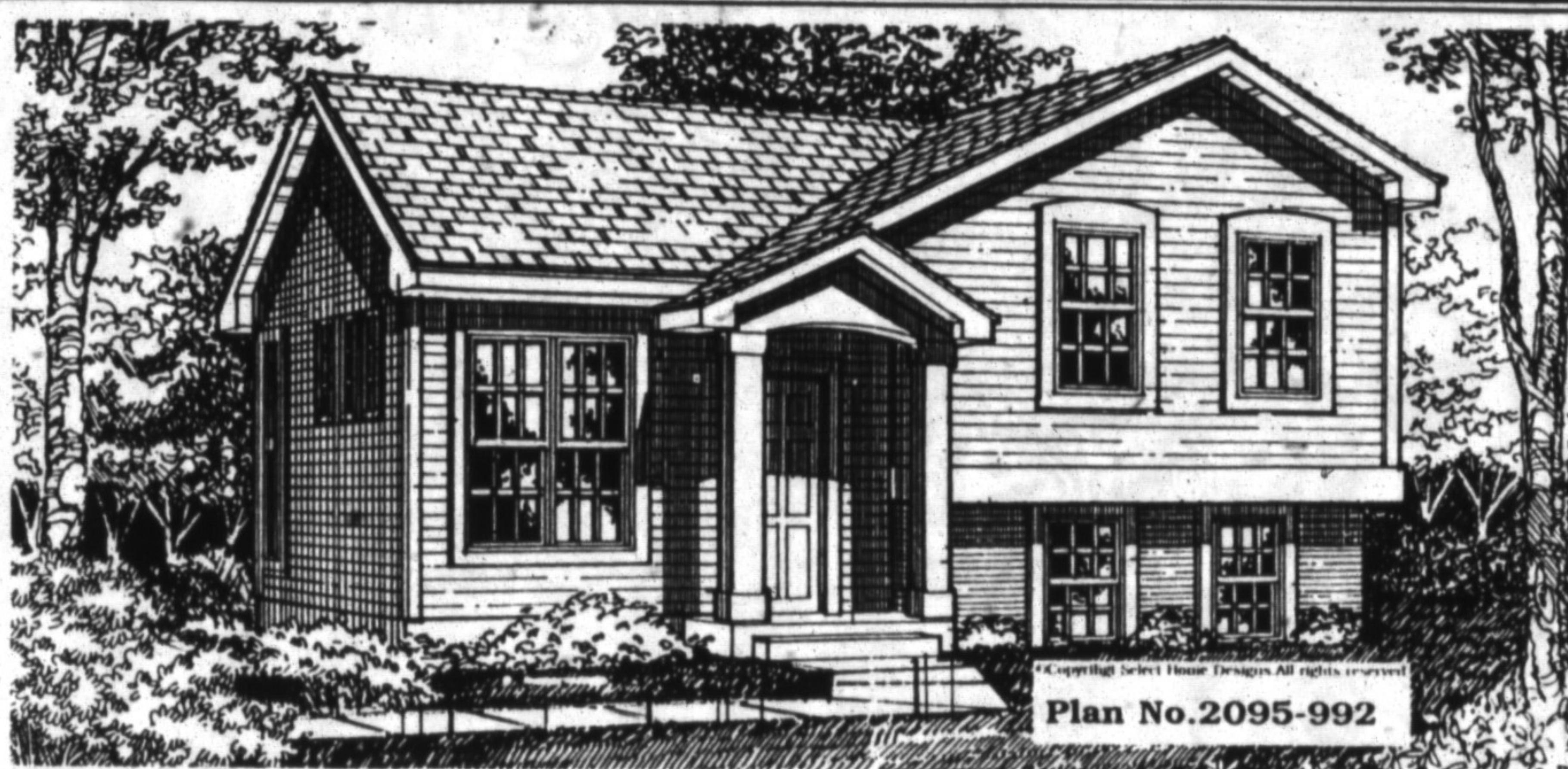
Plan No. 2095-992

Send for Canada's largest plan book with more than 500 home plans, including a wide variety of architectural styles from luxurious brick manors to affordable bungalows, only $9.95 (including shipping and GST). To order using VISA or MasterCard, call toll-free 1-800-663-6739, fax (604) 251-3212, or send cheque or money order to Design for Living, c/o The Canadian Champion, #301, 611 Alexander Street, Vancouver, B.C., V6A 1E1. Trained consultants are standing by Monday to Saturday to take your order for the plan book, or to provide information about the plan featured in this column.