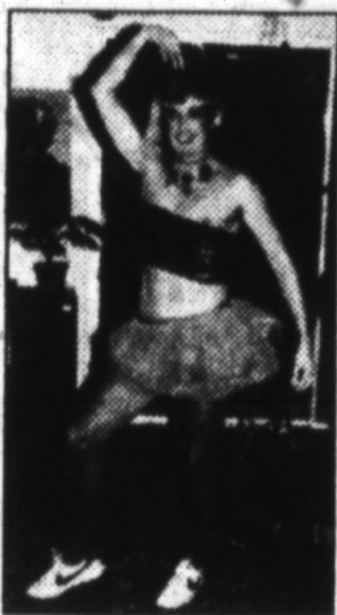
Those were the days! Luv Mag