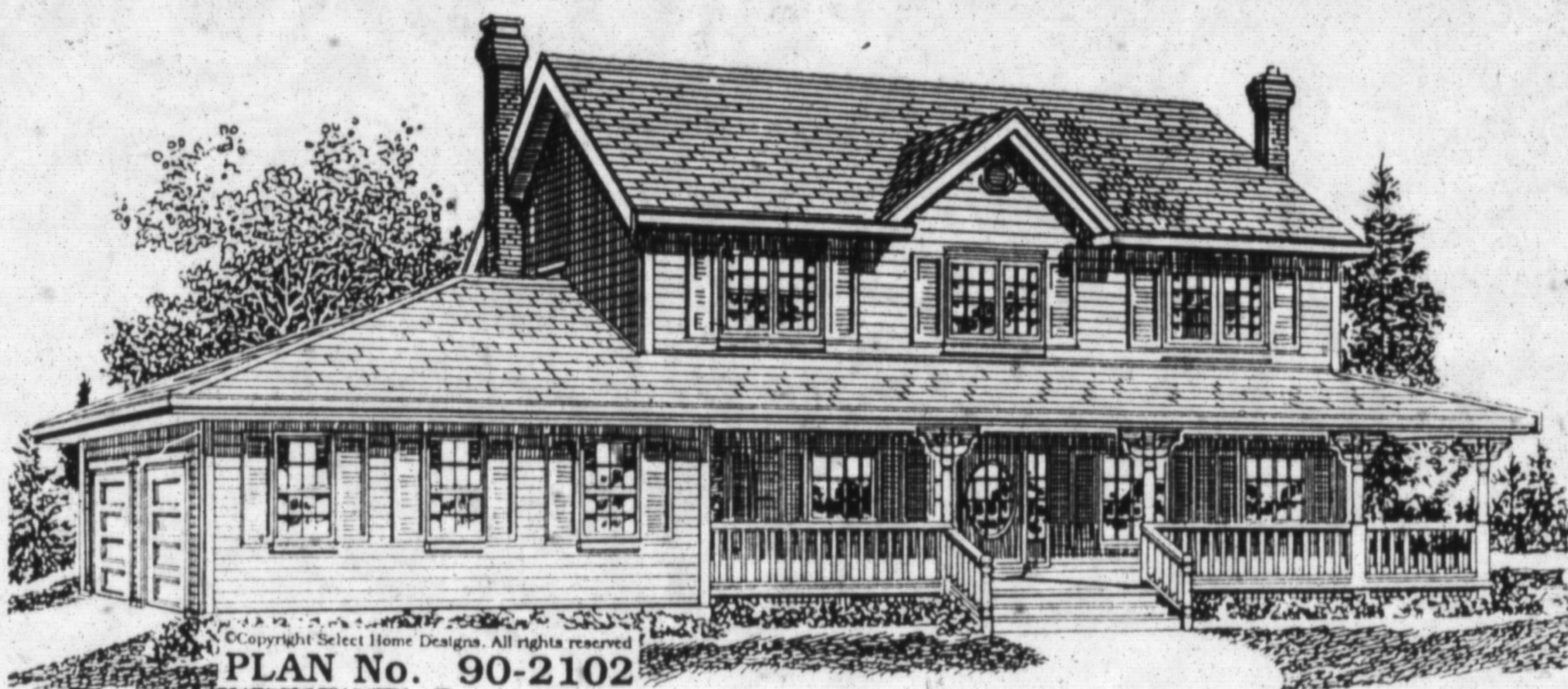
PLAN No. 90-2102