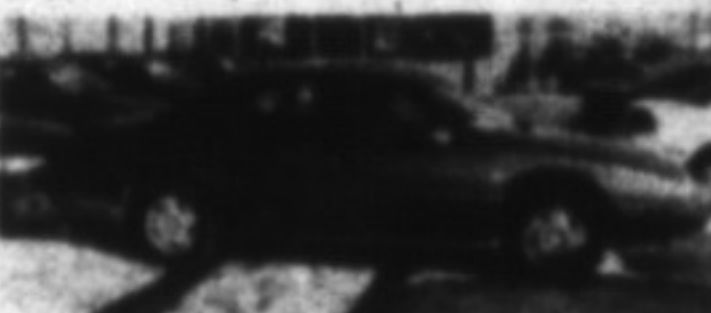
1994 GRAND PRIX SE

3 available, colour selection, V6, air, cond., auto, ABS brakes, full power options, rear split fold down seat, low km's, Bal. of factory warr. Buy $15,995 Lease $279 + taxes 36 months