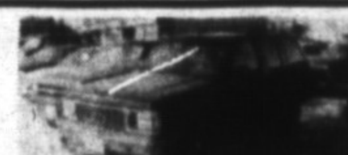
1994 JIMMY SLT 4X4

Red w/graphite interior, 3.1L V6, air, automatic, power windows, locks, tilt, cruise, cass., Bal. of factory warranty. Buy $17,995 Lease $299 + taxes 36 months