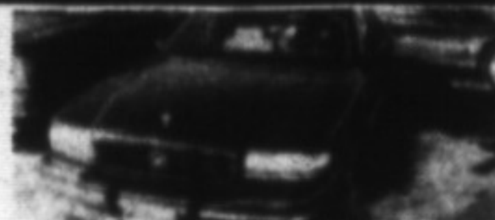
1993 LESABRE LTD

Dark green on tan leather, climate control, air conditioning, power seats, locks, windows, tilt, cruise, cassette, ABS brakes As steal at $13,888