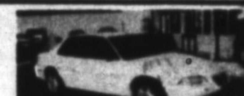
1995 GRAND AM SE

Burgundy on graphite leather, 4 door, air, automatic O/D trans., full power incl. drivers seat, in new condition, only 43,500 km. Bal. of factory warranty. Only $25,888 Lease $399 + taxes 36 months