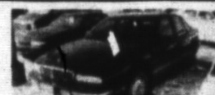
1993 REGAL LTD.

Jade green on grey, 3.8L V6, AC, P/W, P/L, tilt, cruise, cass., bal. of factory warr. Buy $20,888 Lease $389 + taxes 36 months