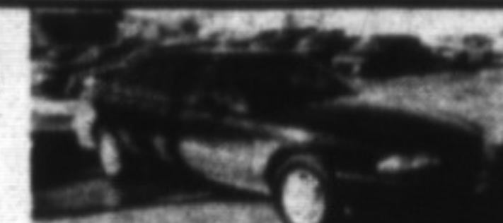
1992 BONNEVILLE SE

Blue on blue, V6, automatic, air conditioning power windows, locks, tilt, cruise, cassette, low kms, bal. of factory warranty. Buy $17,695 Lease $339 + taxes 36 months