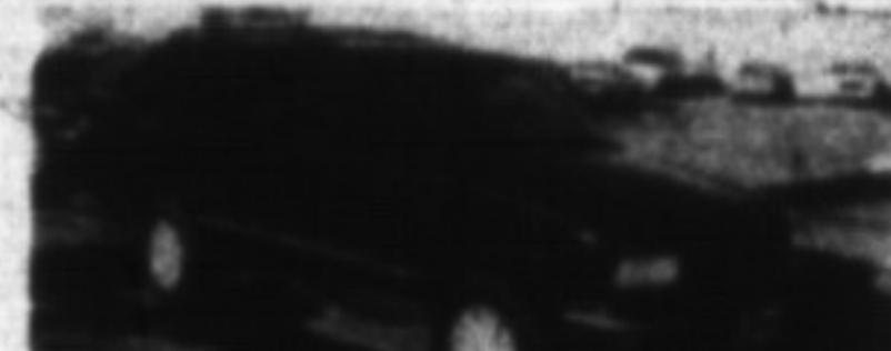
1995 JIMMY SLS

Teal blue on grey, 8 passenger, air, automatic, tilt, cruise, cassette, only 60,000 kms Only $15,888