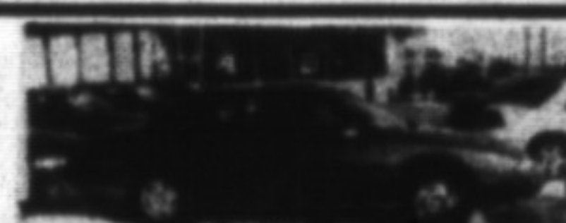
1995 GRAND PRIX

Grey, air conditioning, automatic, V6, ABS brakes, cassette, 45,000 kms, bal. of factory warranty. Only $12,995