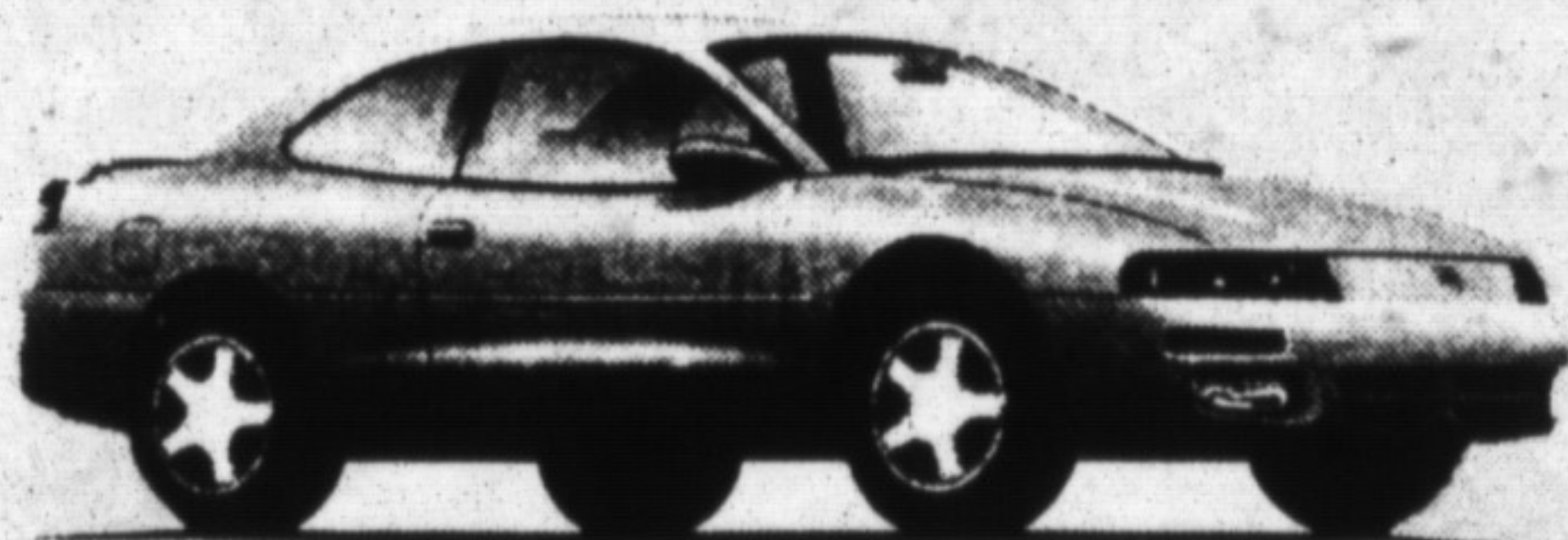
1995 DODGE AVENGER