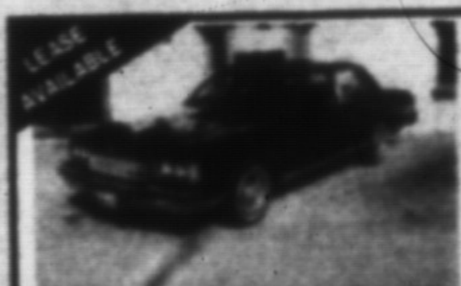
1986 CHEV CAPRICE

Please Inquire about our New 6 MONTH/ 10,000 km POWERTRAIN WARRANTY Included with Most Cars