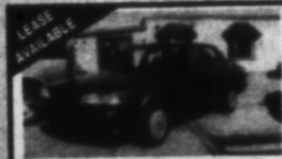
1990 TOYOTA CAMRY SE

Only 84,000 km!! One owner, auto, air, cruise, tilt, delay wipers, PW, PL, cassette, trunk rack & more, Toyota warranty.