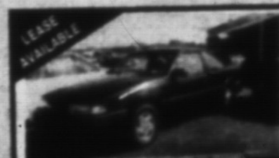
1991 CHEV CAVALIER RS, 2 DR.

WEEKLY PRICE BEATER V6, auto, air, cruise, tilt, delay wipers, cassette, very clean. Warranty.