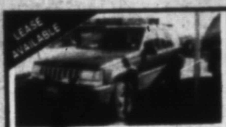
1994 JEEP GRAND CHEROKEE LAREDO 4X4

Only 28,000 km!! V8 engine!! Fully loaded incl. aluminum rims & more. ABS brakes, Chrysler warranty.