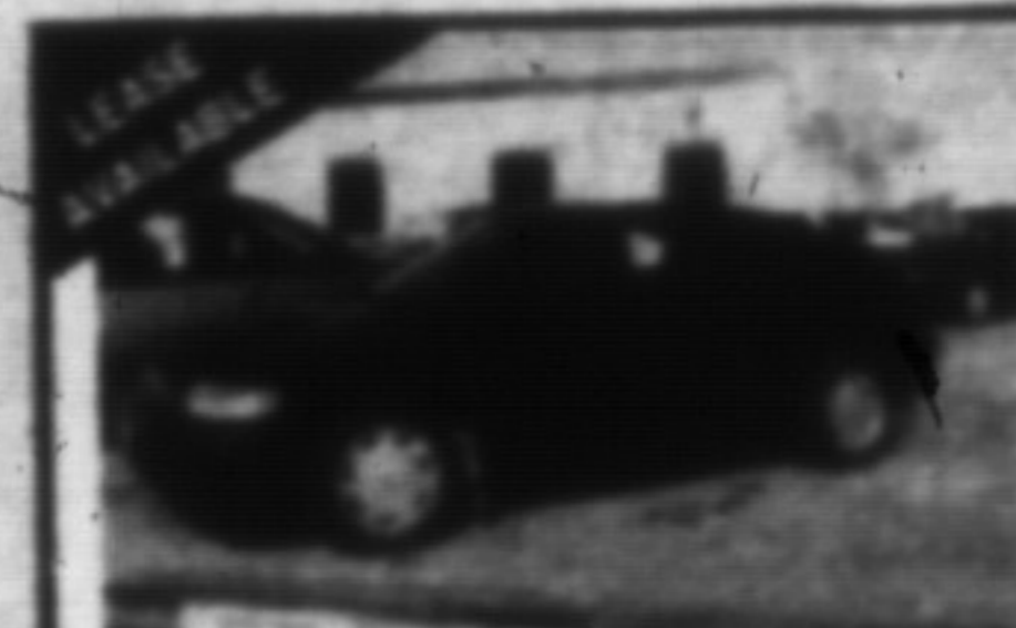
1988 HONDA CRX S

One owner, 5 speed, any/m cassette, very clean. Warranty.