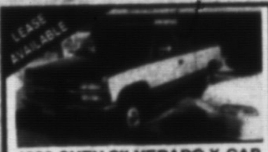
1992 CHEV SILVERADO X-CAB 4X4

Only 40,000 km!! Local one owner, 350 engine, fully loaded incl. box liner, balance of GM warranty.