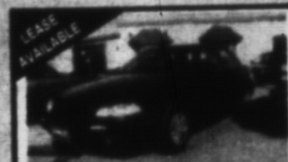
1994 PONTIAC GRAND AM SE

3 to choose from!! V6, air, cruise, tilt, delay wipers, PW, PL, cassette, ABS brakes & more.