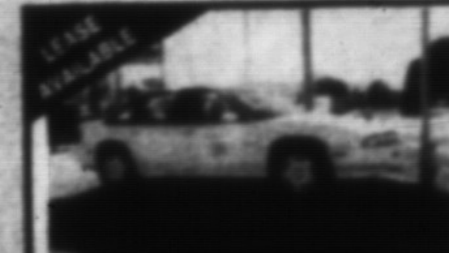
1991 PONTIAC GRAND PRIX STE

Power moonroof & leather!! Every option possible, top of the line. Warranty.