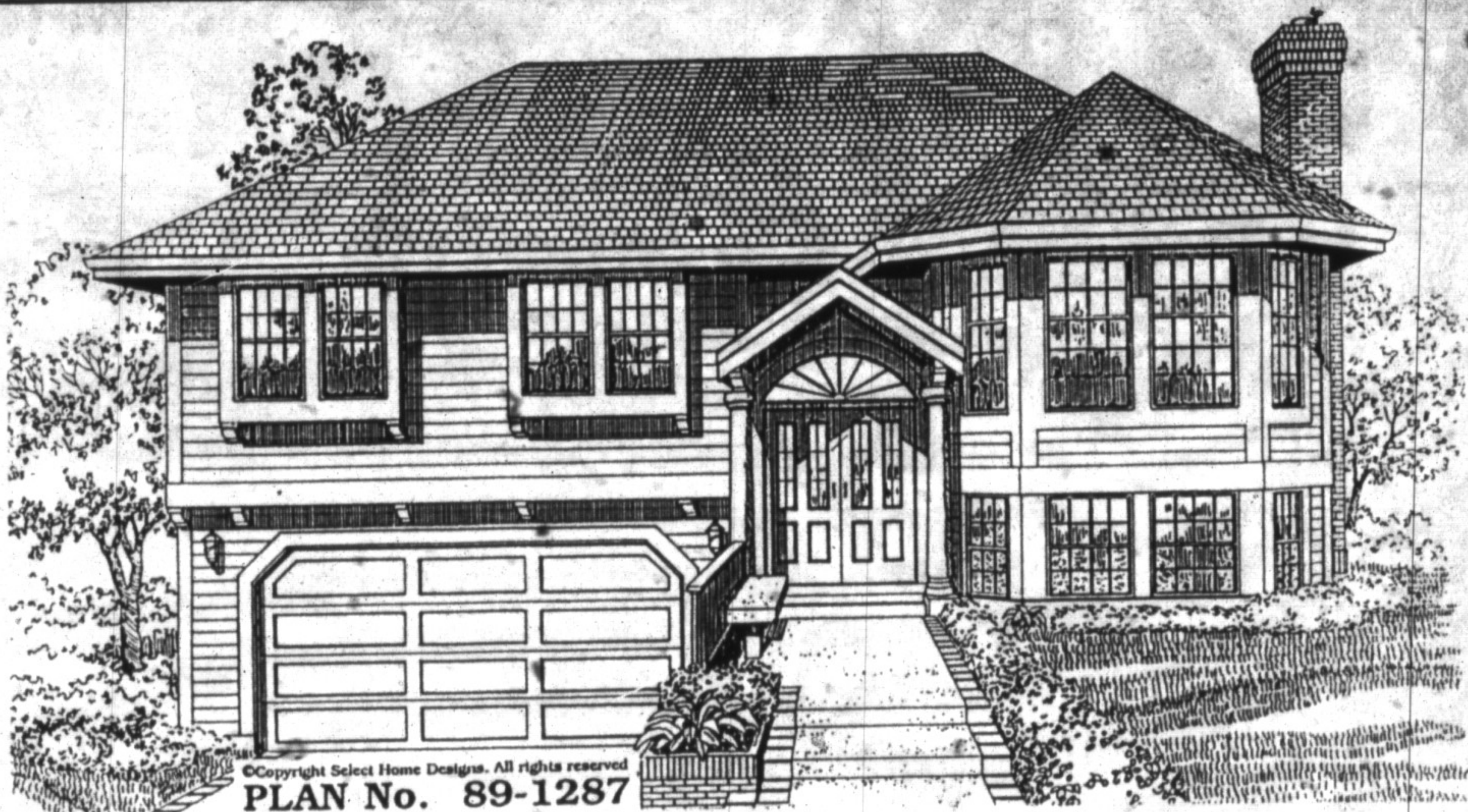
PLAN No. 89-1287