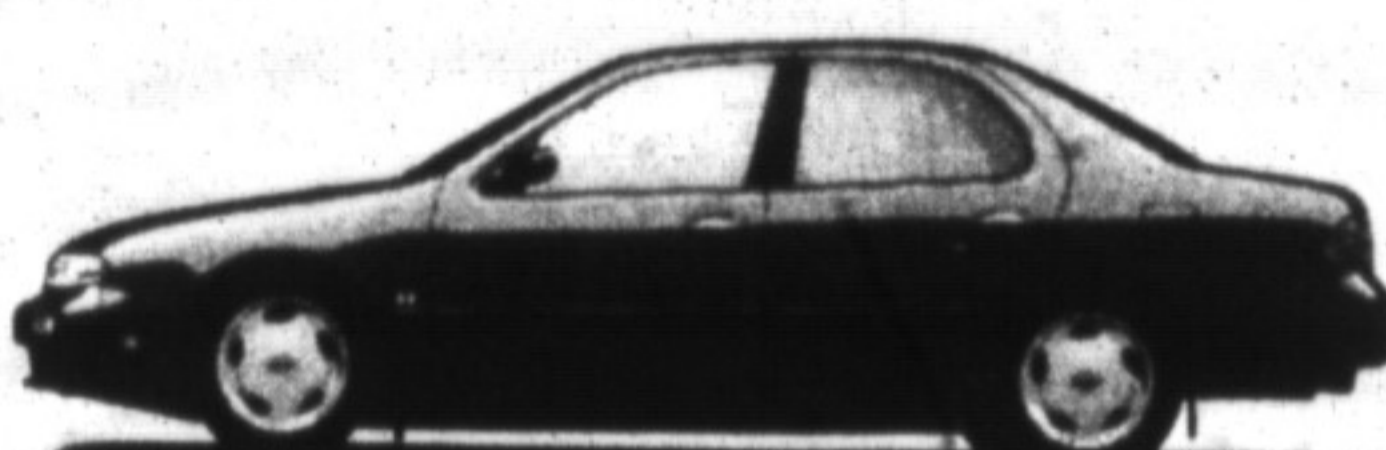
The 1994 Nissan Altima XE

Standard features include: 110 horsepower, 1.6 litre DOHC 16-valve engine, power brakes, 4-wheel independent suspension, child protected door locks, 5 passenger seating, styled-steel wheels, dual outside mirrors and much more.