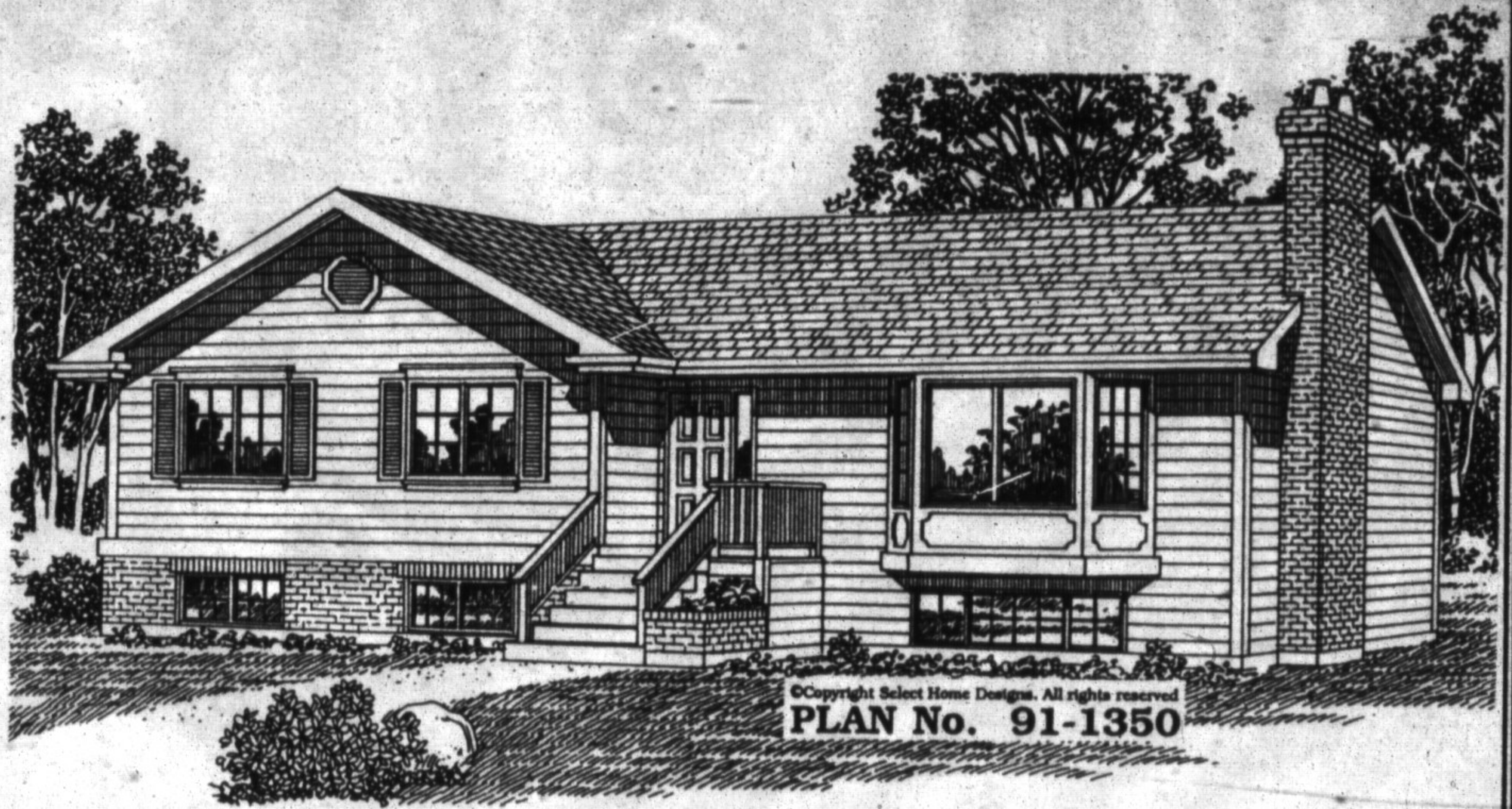
PLAN No. 91-1350

Send for Canada's largest plan book with over 500 home plans, including a wide variety of architectural styles from luxurious brick manors to affordable bungalows, only $9.95 (including shipping and GST). To order using VISA or MasterCard, call toll-free 1-800-663-6739 or send cheque or money order to Design for Living, c/o The Canadian Champion, 382 West Broadway, Vancouver, B.C., V5Y 1R2. Trained consultants are standing by Monday to Saturday to take your order for the plan book, or to provide information about the plan featured in this column.