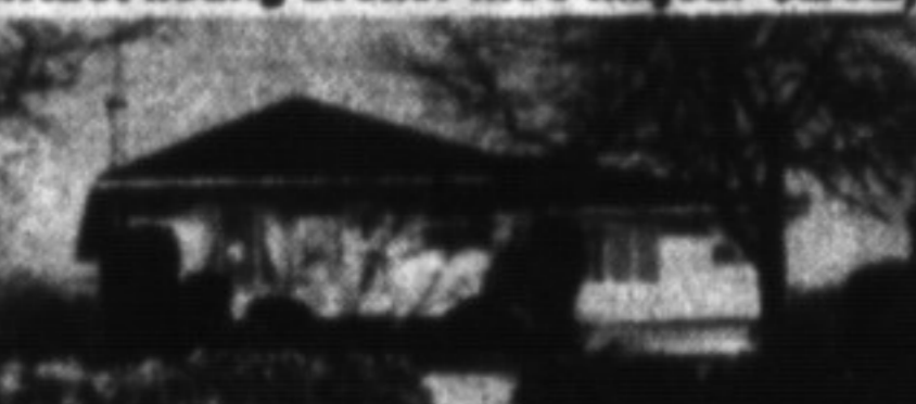
TOWN & COUNTRY

Custom built home with oak trim throughout, 30' family room with Cedar ceiling, central air, three extra large bedrooms, high efficiency gas furnace, central vac, finished rec. rm. 14' x 28' inground pool. A unique beautiful home. Contact Listing Broker Moe Miljour $232,000