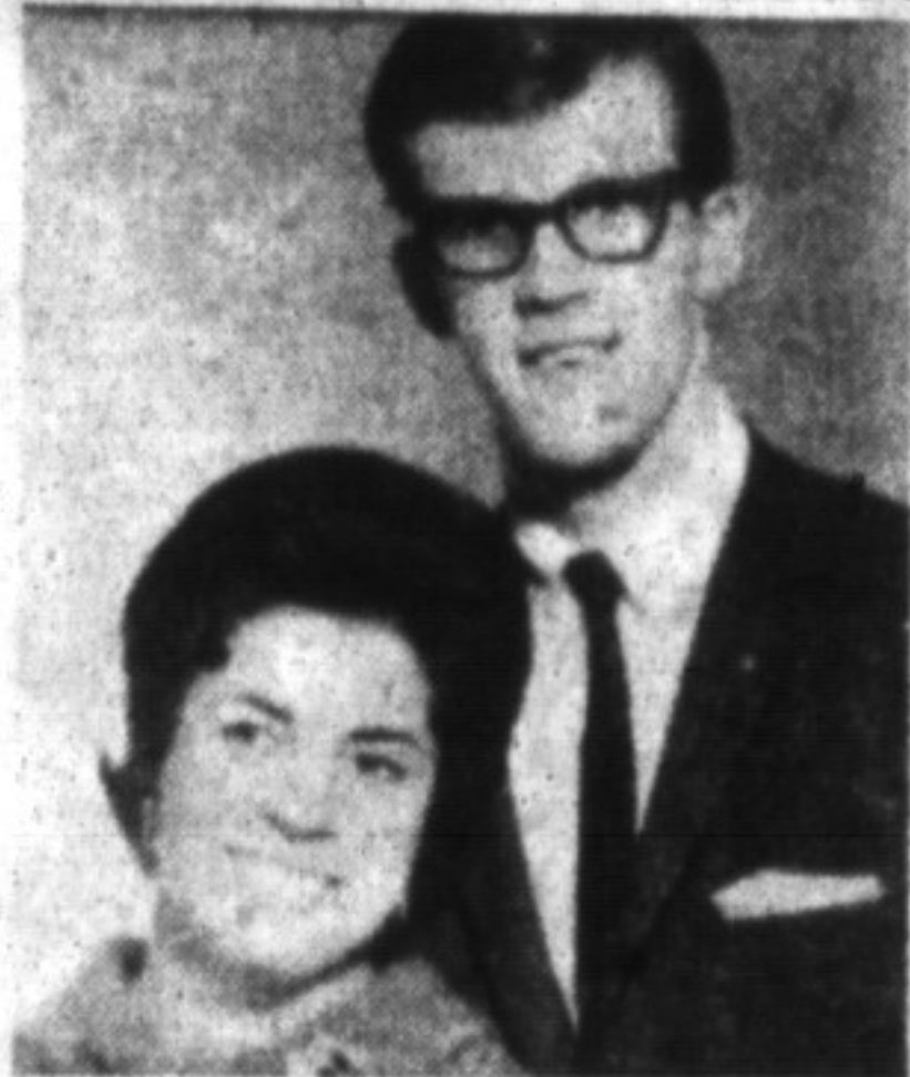
From M & D