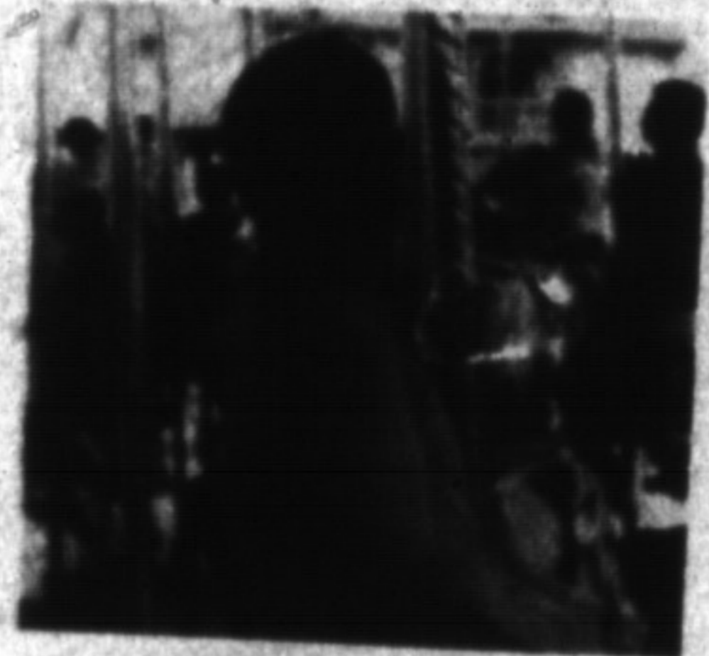
HAPPY BIRTHDAY FROM YOUR FAMILY

It's time to slow down ... You are on the 40th round.