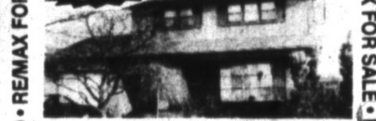
DON'T MISS IT - $189,900

Spring is not that far away to dream of a sparkling inground pool completely fenced from the play area. Now for the house - 4 bedrooms, 2 baths, large kitchen and finished rec. room. CALL LISTING BROKER MOE MILJOUR