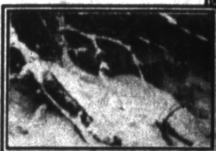
"COUGAR IN THE SNOW" by Robert Bateman