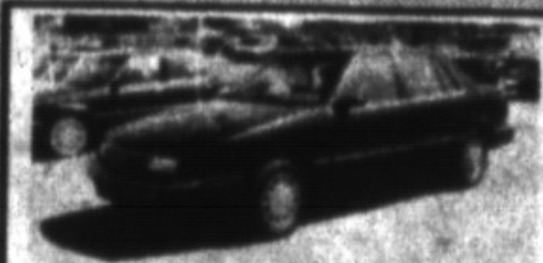
1990 DODGE SHADOW 4 dr. auto, lift, cruise. Sharp car at a great price. NOW