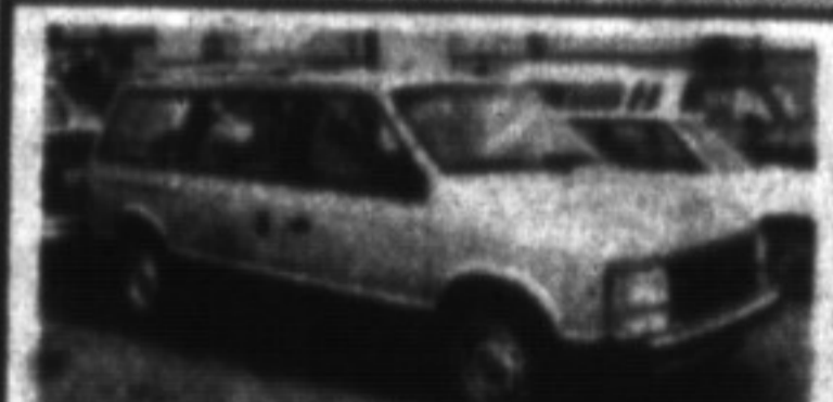
1991 GRAND VOYAGER LE What a beauty! Fully loaded one owner and ready to go. DEAL AT