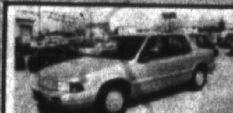
1992 DODGE SPIRIT Very clean vehicle with lift and cruise. SPECIAL