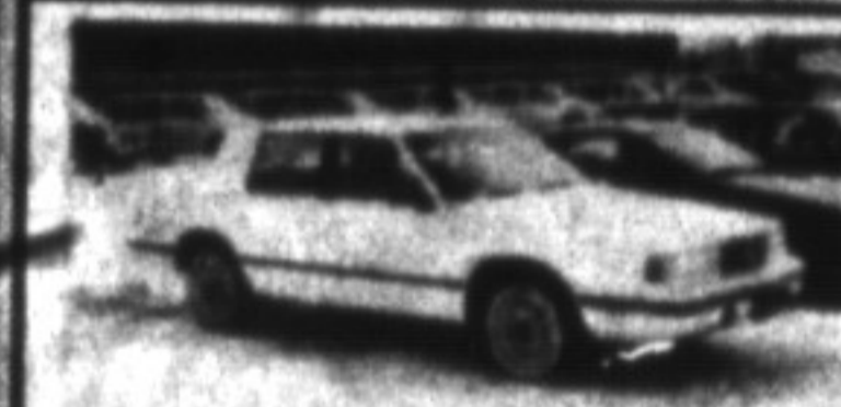
1993 DYNASTY LE Excellent condition with lots of equipment and only 21,000 km. DEAL AT