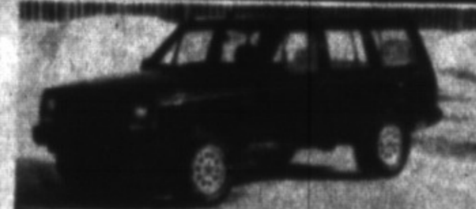
1990 JEEP CHEROKEE LTD.

A one owner well kept vehicle that looks and drives like new fully loaded including leather interior with only 66,000 km and ext. warranty.