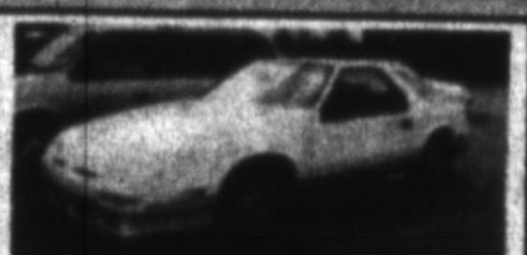
1989 DAYTONA ES Sharp looking vehicle with an auto trans. $6899 NOW