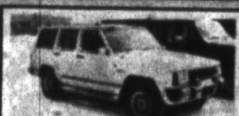
1991 CHEROKEE SPORT 4 dr. auto, air 4x4 purchased here originally SUPER DEAL