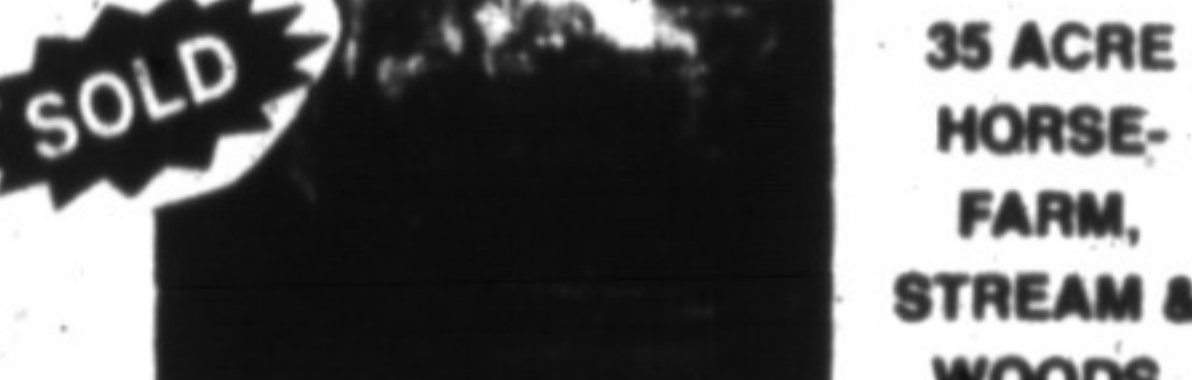
35 ACRE HORSE-FARM, STREAM & WOODS

On a delightfully wooded 2 acres, 4+ bedrooms vaulted ceilings, the list goes on!! $399,000