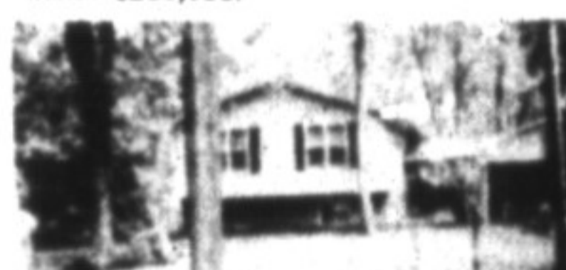
COZY NIGHTS ...

A picturesque country road winds its way to this gorgeous Cape Cod Confederation Log home nestled away on two of Mother Nature's finest acres. That warm, comfortable feeling that wood provides can be felt throughout this five bedroom, three wash-room home with a forest at your doorstep. $369,900