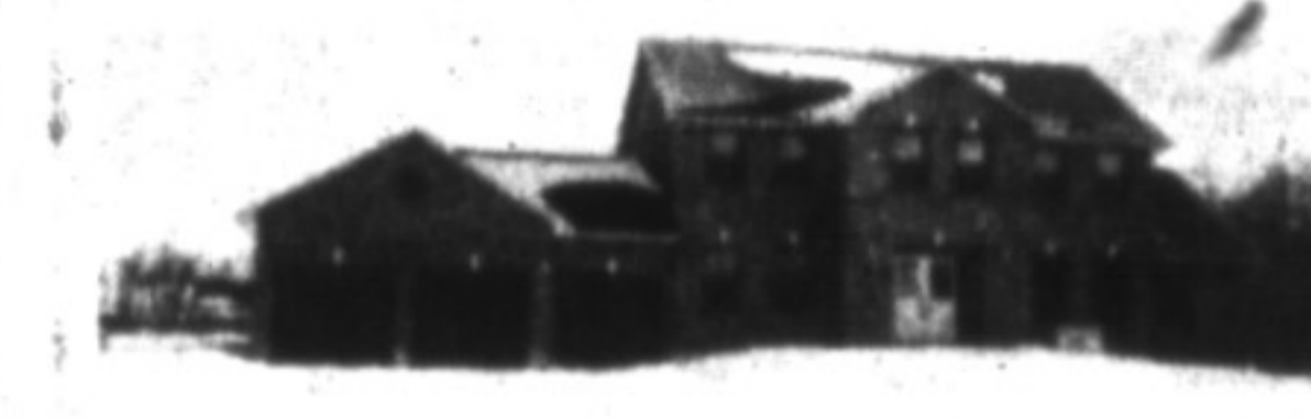
FABULOUS MODEL HOMES - BROOKVILLE $329,900

884 Birch, quiet family-oriented street. Come and check out this 4 bedroom home with main floor family room and finished rec. room. $187,900.