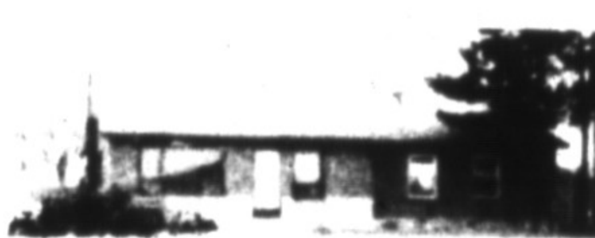
STEELES AVE. & WINSTON CHURCHILL

4 Bedroom home on 10 beautiful acres. North of Milton.