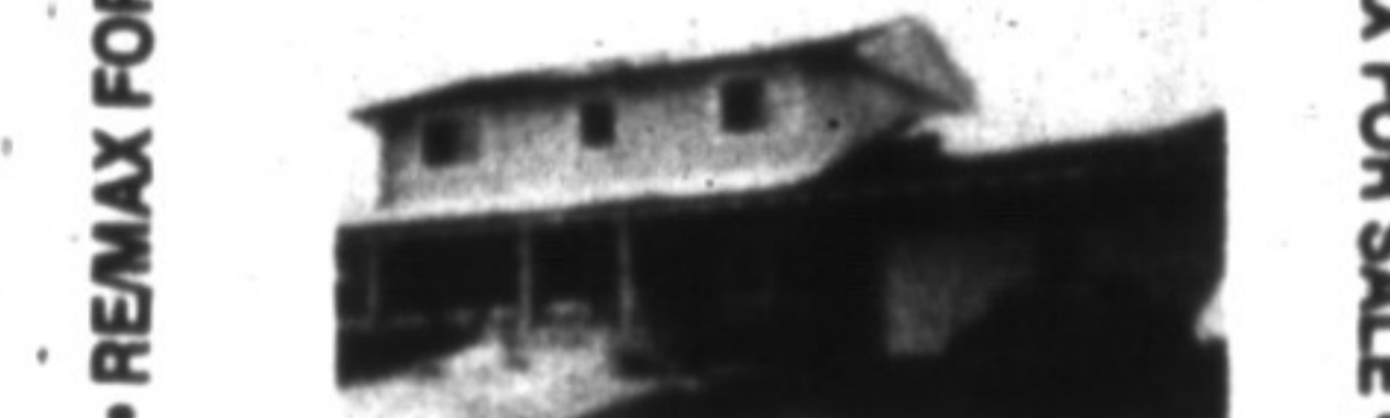
HOT TUB & JACUZZI

Get looking now! The toys are all included in this renovated home: