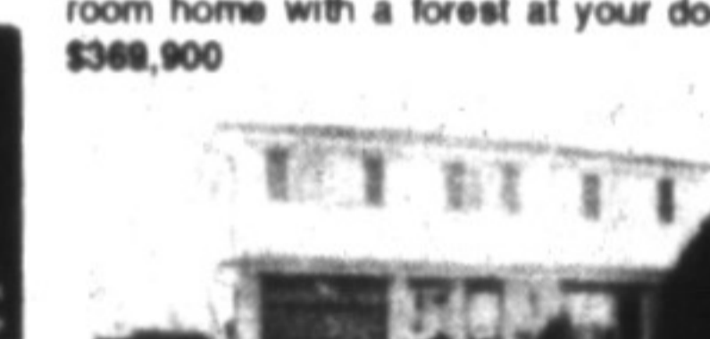
FINISHED TOP TO BOTTOM...

Are enjoyed in the rustic country-style rec. room beside the fireplace in this fine Campbellville home. The popular open concept design allows full enjoyment of the beautiful 3/4 acre from the living room and dining room. If the peaceful country life beckons, please call Mike to take a look. NOW $229,900.