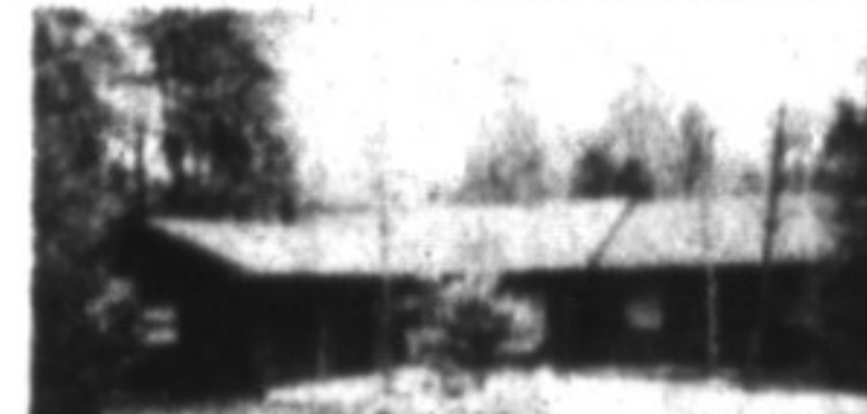
YOU'LL BE DELIGHTED

Conveniently located just outside of town is the log home of your dreams. The focal point becomes the 22' x 27' Great Room with its efficient airtight woodstove, cathedral ceilings and view of the wooded landscape. Excellent quality construction and workmanship. Experience the great feeling of wood. Call Mike $289,900.