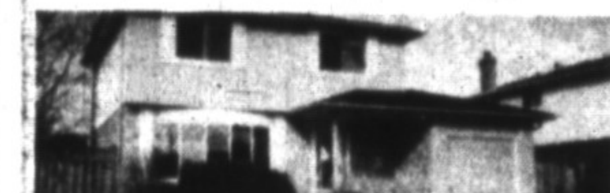
LOCATION! LOCATION! LOCATION!

A bright, spacious end unit. Refurbished kitchen, new flooring, finished basement. $118,000.