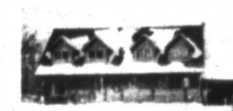
"WOODEN" IT BE NICE!

Conveniently located just outside of town is the log home of your dreams. The focal point becomes the 22' x 27' Great Room with its efficient airtight woodstove, cathedral ceilings and view of the wooded landscape. Excellent quality construction and workmanship. Experience the great feeling of wood. Call Mike $289,900.