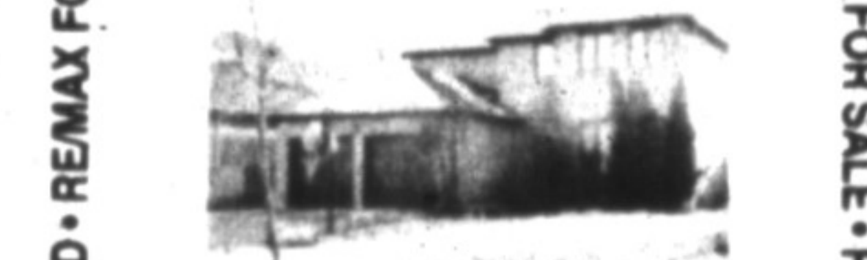
ROOM TO MOVE

A leaded glass door creates a sparkling entrance to this roomy four bedroom home. A large yard, central vac., family room & fireplace are just a few of the many features. $239,000.