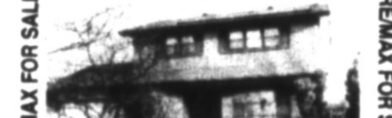
DON'T MISS IT - $189,900

Spring is not that far away to dream of a sparkling inground pool completely fenced from the play area. Now for the house - 4 bedrooms, 2 baths, large kitchen and finished rec. room.