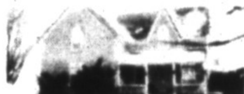
CENTURY STONE, C'VILLE

High on a hill with maple tree-lined drive, this 12 acre property with fruit trees and open fields and features and immaculate, renovated gabled farmhouse with 4 bdrms., 3 baths, comfortable L.R. & D.R., lg. country sized kit. M.F. lan.rm. with F.P.A. walkout, fn. basement & huge oversized 2 car garage. Ideal for small horse farm or country retreat. Lindsay J. McLaren ..... $419,900