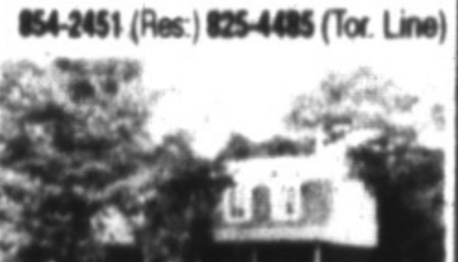
CAMPBELLVILLE COUNTRY DELIGHT

2 story home on very pretty 10 acre setting featuring 4 bdrms., walkout from kitchen to deck, family room with F.P., den with F.P., French doors, 3 bedrooms, separate stairs from back hall to basement. There's much more so call today for details. Lindsay J. McLaren $389,900.