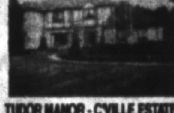
TUDOR MANOR - CVILLE ESTATES Nestled amongst mature trees on professionally landscaped 2 acre lot. Meticulously cared for 4 bdrm. Manor with huge Hollywood style kitchen in cherry, open to pine wainscotted fam. rm. with F.P. Walkout to inground pool, formal L & D rm., open spiral Oak staircase, den in Pine overlooks sunken sun room with F.P. Lindsay J. McLaren.....$650,000