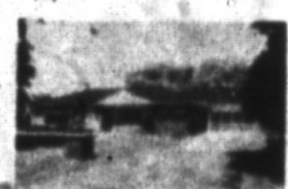
MOVE IN CONDITION Martin Street, beautiful custom built bungalow with very large 153' x 185' nicely landscaped lot. 2+ car garage. Home approx. 1950 sq. ft. Close to all amenities. Call today to view. Was $299,900. Lindsay J. McLaren.....$208,900