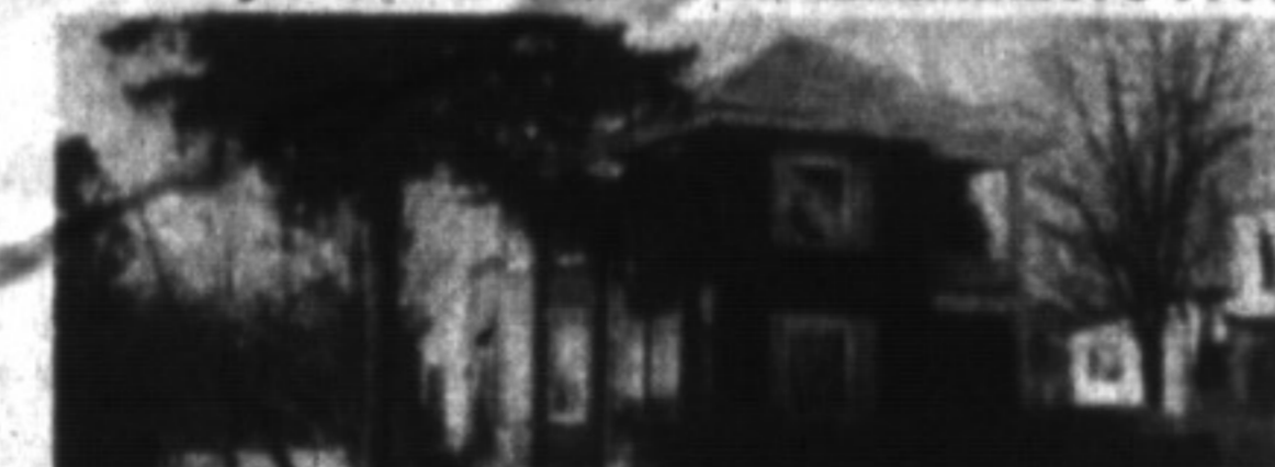
ONCE IN A LIFETIME Beautiful brick home, backing onto old mill pond. Home itself features updated kitchen, glass addition overlooking pond, cedar deck and many more upgrades. For a lakeside environment in the heart of town. $299,500. Call Gary Thomas .....878-7777