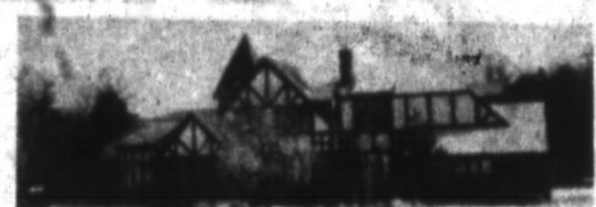
CROWNED WITH CLASS Custom built English Tudor style. Features extensive landscaping, cedar deck with hot tub. Set on gorgeous 2.86 acre lot in Campbellville. $445,000. Call Gary Thomas .....878-7777

LAND FOR SALE 132 Acres of farmland Derry Rd. 10 minutes west of Milton. $6,300/acre CALL GARY FOR DETAILS.