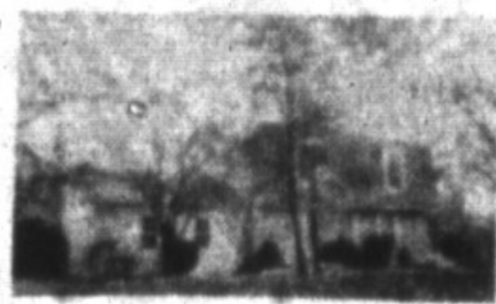
2 STOREY COLONIAL Sitting on 150' x 77' lot and featuring pine floors in living & dining rooms, pine kitchen opens to family room with FP & heatstator, 3 large bedrooms, 2 bathrooms, and much more. Located just min. to Milton & on town water. Lindsay J. McLaren ..... $238,900