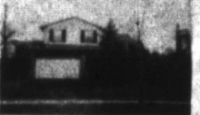
TIMBERLEA EXECUTIVE Beautiful side-split home features 4 bedrooms, main floor family room, eat-in kitchen, comfortable living room/dining room combination. 3 baths, large finished rec. room and located on quiet crescent with inground pool. Huge pie-shaped lot. Lindsay J. McLaren .....$236,900