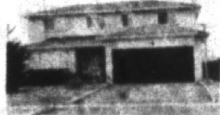
METICULOUS, QUALITY HOME Features 4 bedrooms, 3 baths, custom eat-in kitchen, main floor family room with F.P., formal living room/dining room, finished rec. room with central air, central vac., broadband and hardwood floors. Lindsay J. McLaren ..... $198,900