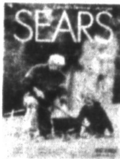
FALL & WINTER