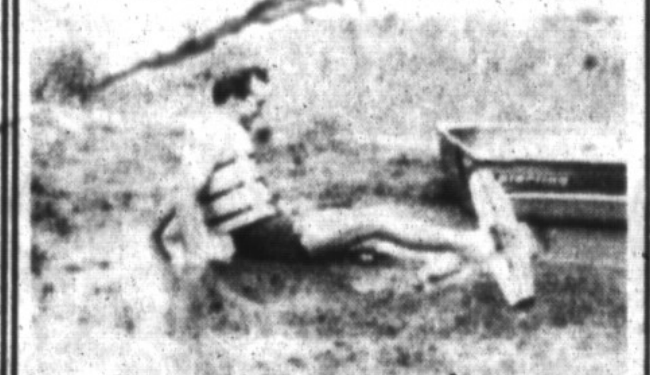
Happy Birthday from the V.R. Gang November 21, 1993