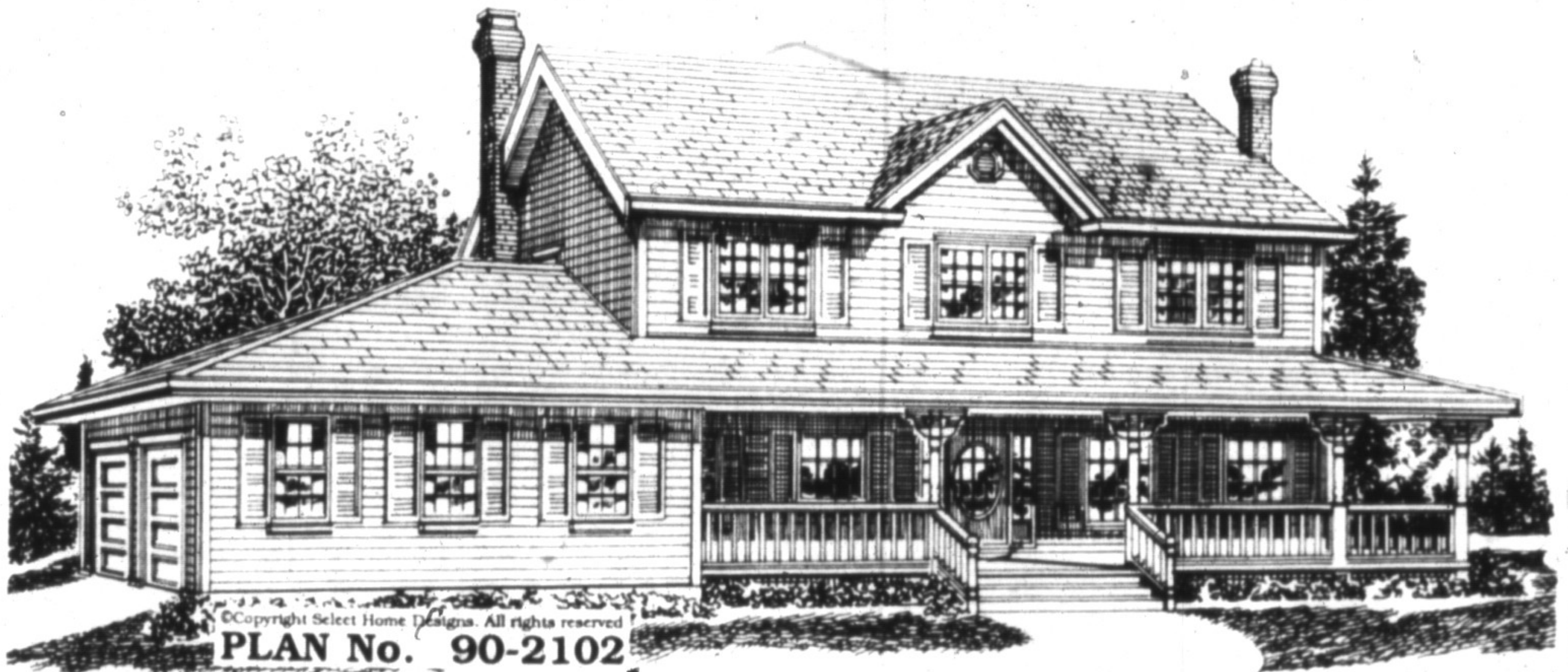
PLAN No. 90-2102

Send for Canada's largest plan book with more than 500 home plans, including a wide variety of architectural styles, from luxurious brick manors to affordable bungalows, only $9.95 (including shipping and GST). To order using VISA or MasterCard, call toll-free 1-800-663-6739 or send cheque or money order to Home of the Week, c/o The Canadian Champion, 382 West Broadway, Vancouver, B.C., V5Y 1R2.