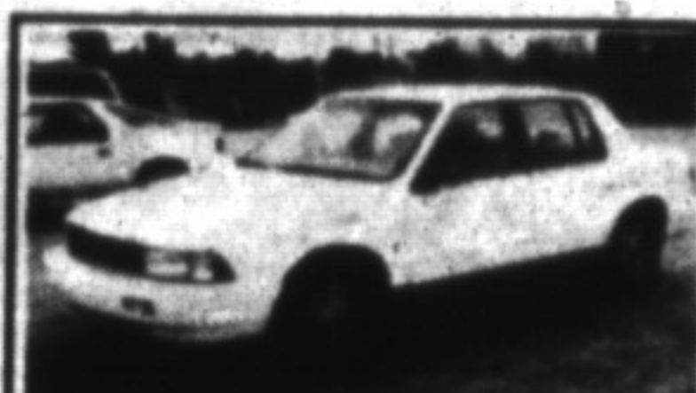
1990 ACCLAIM LE 4 door, V6 engine, loaded. VERY SHARP! $9,995

At Milton Chrysler our sales staff are experienced, courteous and knowledgeable. All sales staff are qualified to discuss your requirements, trade value and financial arrangements, so come in and talk to a pro - you won't be sorry!