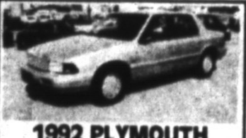
1992 PLYMOUTH ACCLAIM V6 engine, air, tilt, cruise. BRIGHT WHITE $10,995