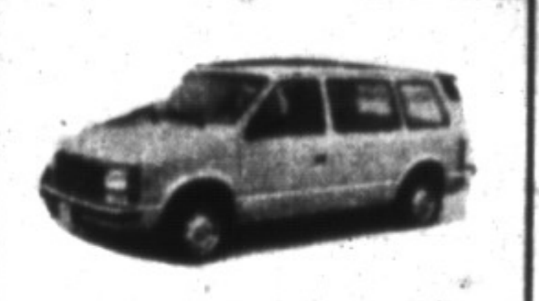
1987 CARAVAN SE V6 engine, 7 passenger, air. WELL KEPT. $7,995