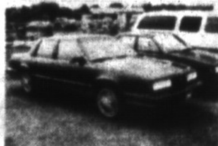
1991 PONTIAC 6000 LE Only 75,000 km!! V6, overdrive, air conditioning, AM/FM stereo & more. $9,975