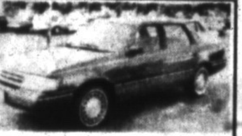
1988 FORD TEMPO 4 door, air cond., red. GREAT VALUE! $4,995