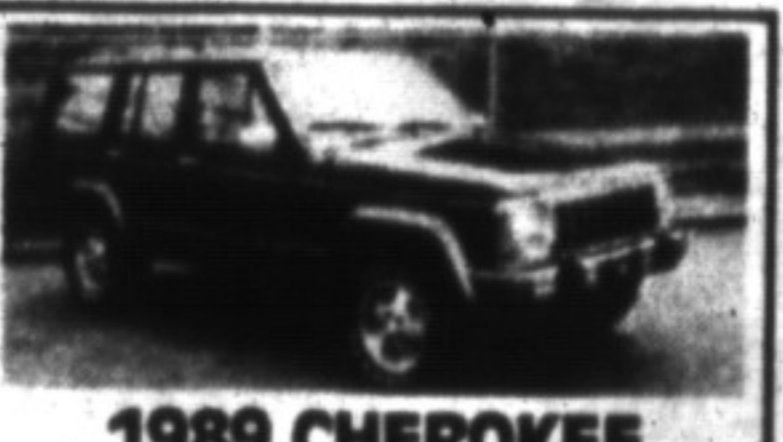
1989 CHEROKEE LAREDO 6 cyl, air, tilt, cruise. BRIGHT RED $10,995