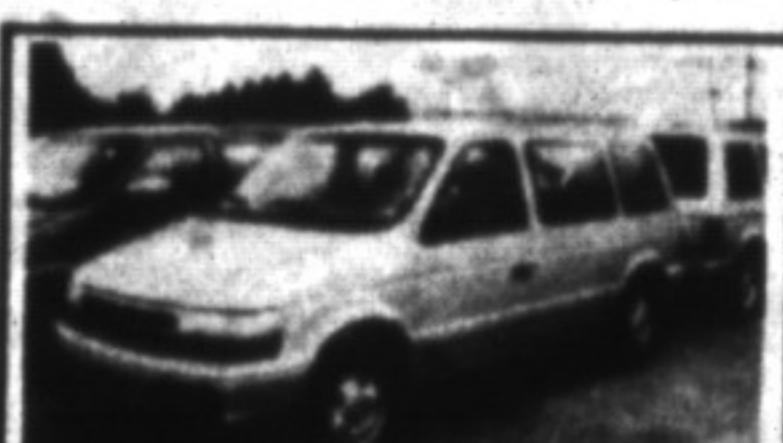
1993 CARAVAN SE V6, 7 passenger, tilt, cruise, air. LIKE NEW! $17,999