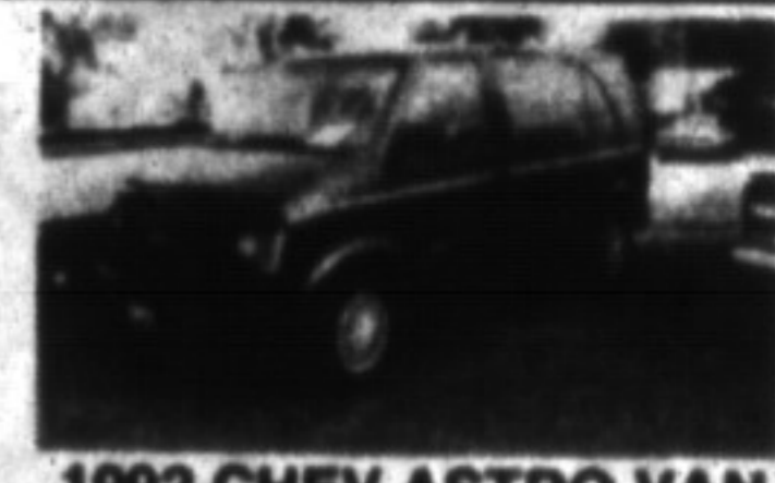
1992 CHEV ASTRO VAN One owner, V6, eight passenger, air, cruise, tilt, delay wipers, P.W., P.L., rear heat, cassette, warranty. SPECIAL $13,896