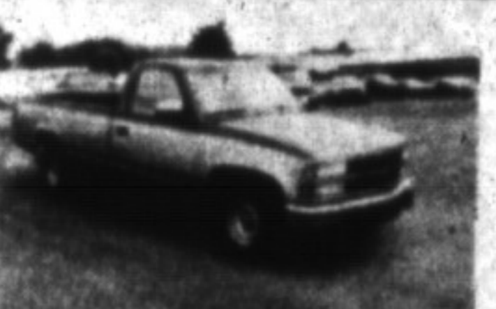
1990 CHEV SILVERADO 1/2 TON Only 82,000 km!! Local one owner, top of the line, fully loaded, warranty. $12,975