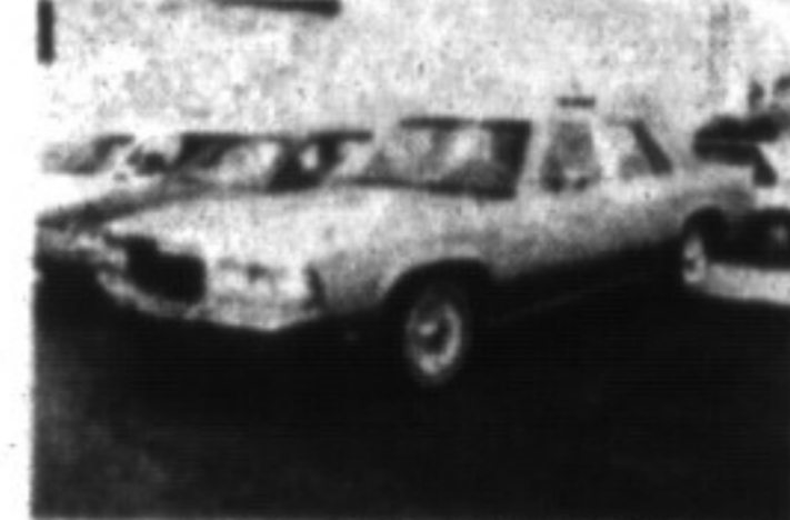
1991 MERCURY GRAND MARQUIS LS One owner, top of the line, fully loaded incl. drivers air bag, power seats both sides, immaculate, higher hwy. miles. $12,975