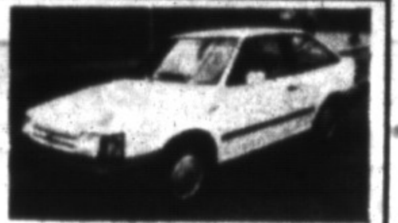
1990 FORD ESCORT 2 door, 5 speed, white. EXCELLENT VALUE! $5,595