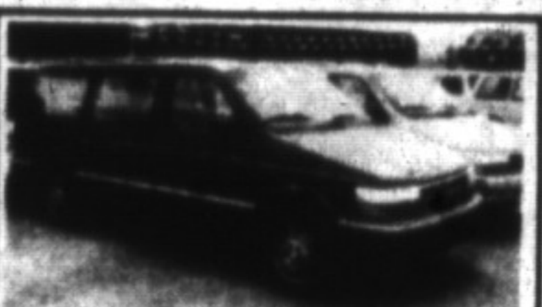
1992 GR. CARAVAN SE V6 engine, loaded, 27,000 km. HUNTER GREEN $20,795