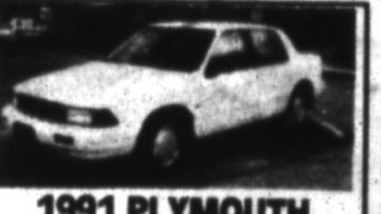
1991 PLYMOUTH ACCLAIM 4 door, auto, air, blue. BEAUTIFUL! $7,995

Price plus P.S.T., G.S.T. and Licence Fee.