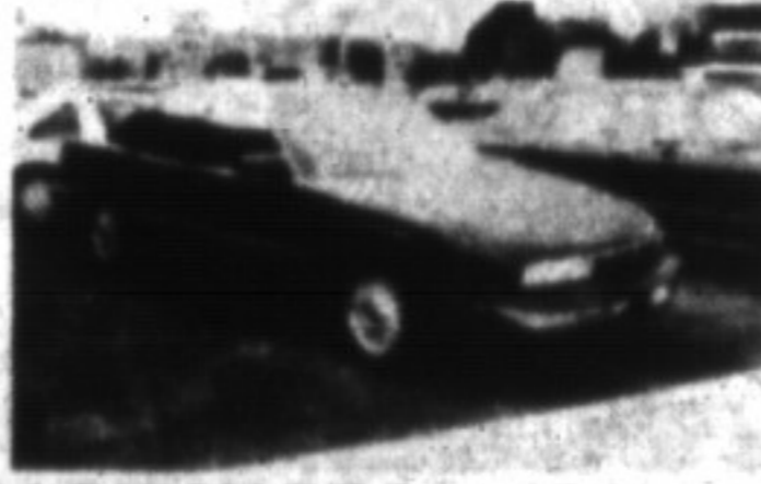
1991 BUICK REGAL LTD. 4 DR. Only 85,000 km!! One owner, V6, fully loaded incl., power seat & aluminum rims, warranty. SPECIAL $12,975