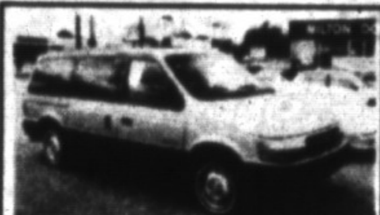
1992 GR. CARAVAN LE Fully loaded, A.W.D., leather. MUST BE SEEN! $20,995