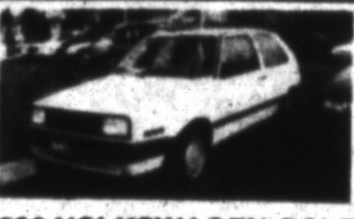
1992 VOLKSWAGEN GOLF Only 45,000 km!! One owner, five speed, moon roof, P.S., P.B., AM/FM cassette & more, balance Volkswagen Warranty. $10,975