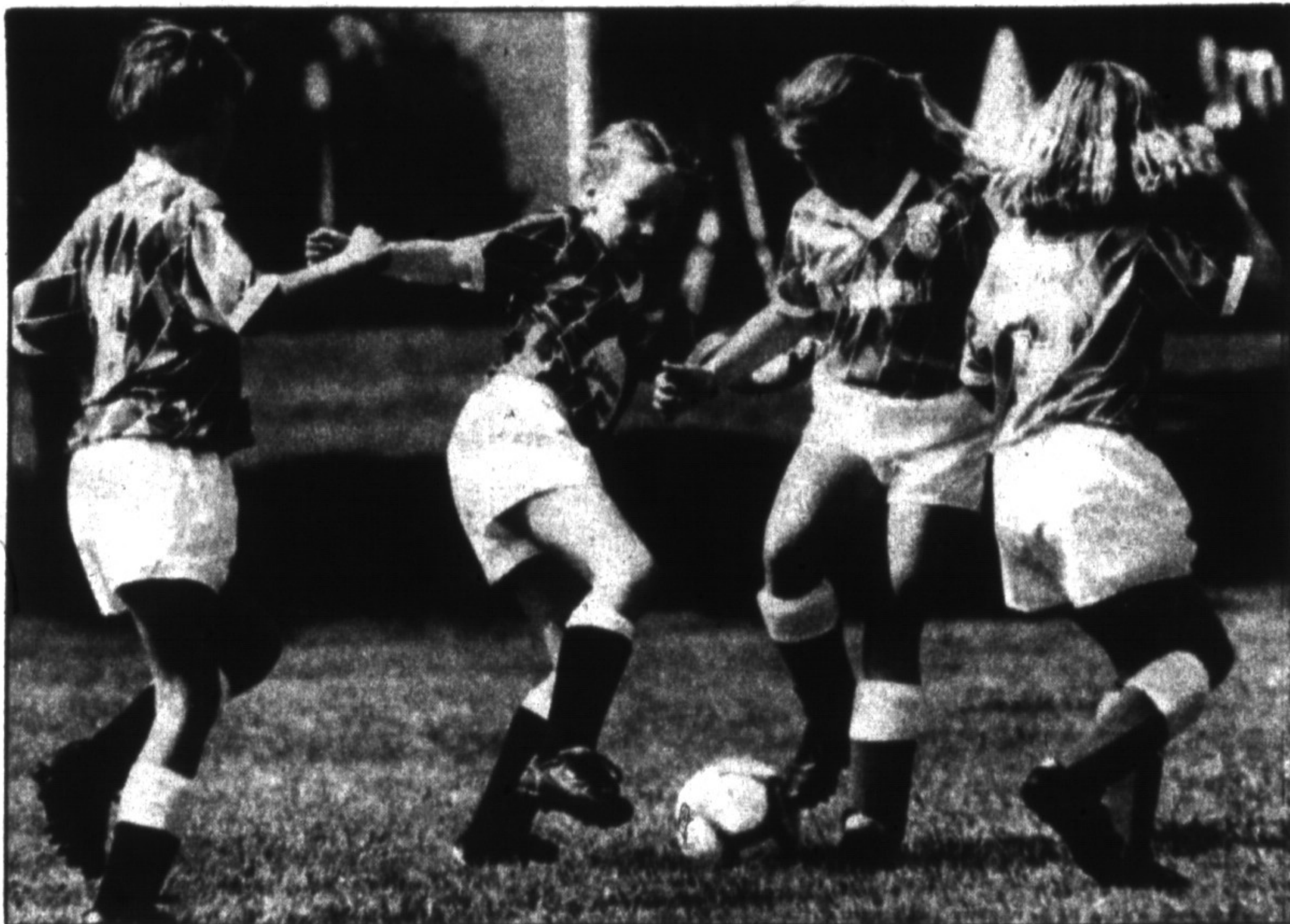
Despite a decline in the number of players, soccer in Milton is still ranks among the most popular sports for children and teens. These kids took part in a tournament last summer.

"Our numbers have declined a little over the past few years because Milton hasn't been growing, but soccer is still the most popular sport in Canada and the Youth Soccer Club is the biggest minor sports organization in town," said presi-