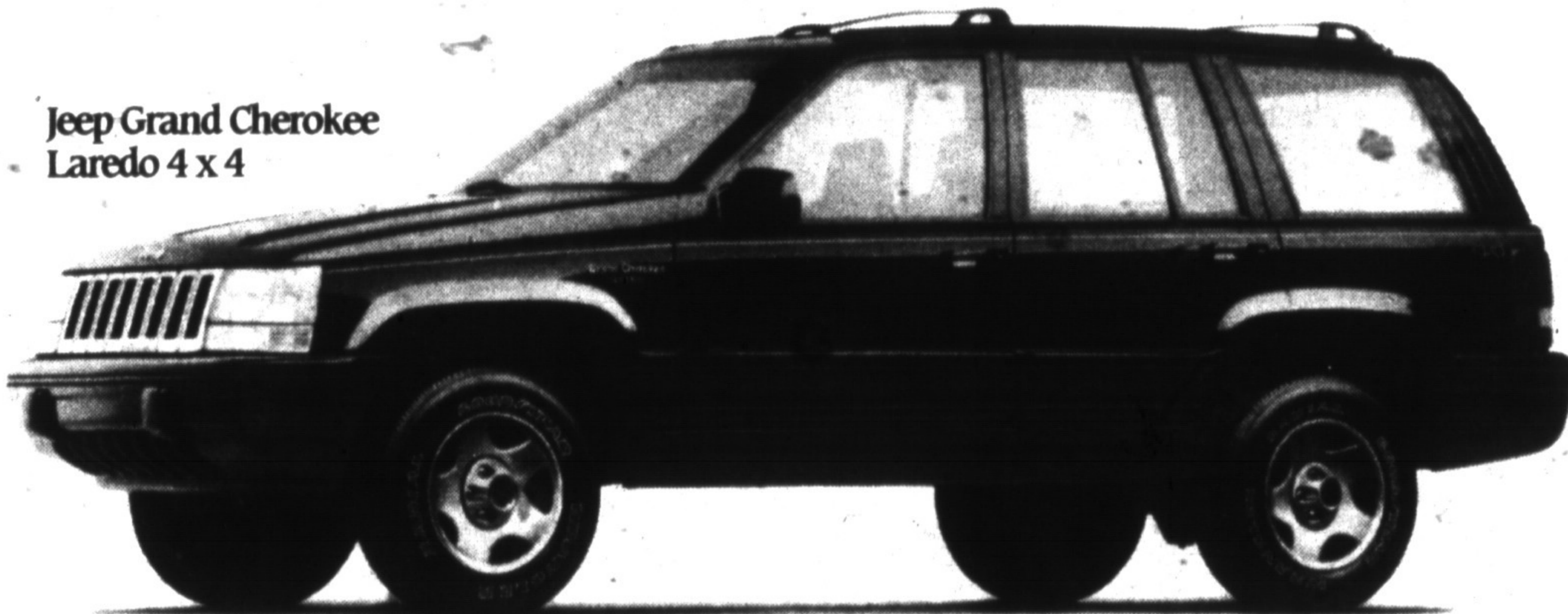
Jeep Grand Cherokee Laredo 4 x 4

WE'RE WORKING TO WIN YOU OVER WITH A SPECIALLY EQUIPPED JEEP GRAND CHEROKEE LAREDO 4 X 4.