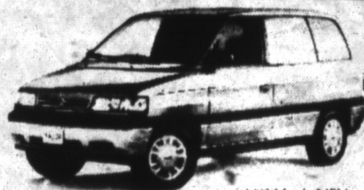
1993 Mazda MPV