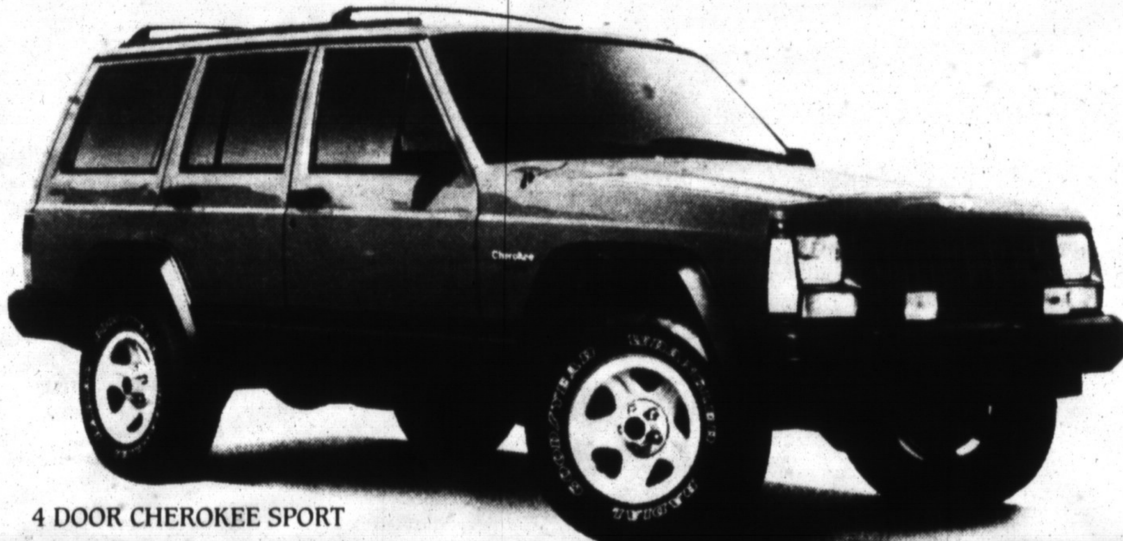
4 DOOR CHEROKEE SPORT

YOU HELPED MAKE JEEP CHEROKEE THE BEST SELLING COMPACT SPORT UTILITY VEHICLE IN CANADA'S HISTORY!