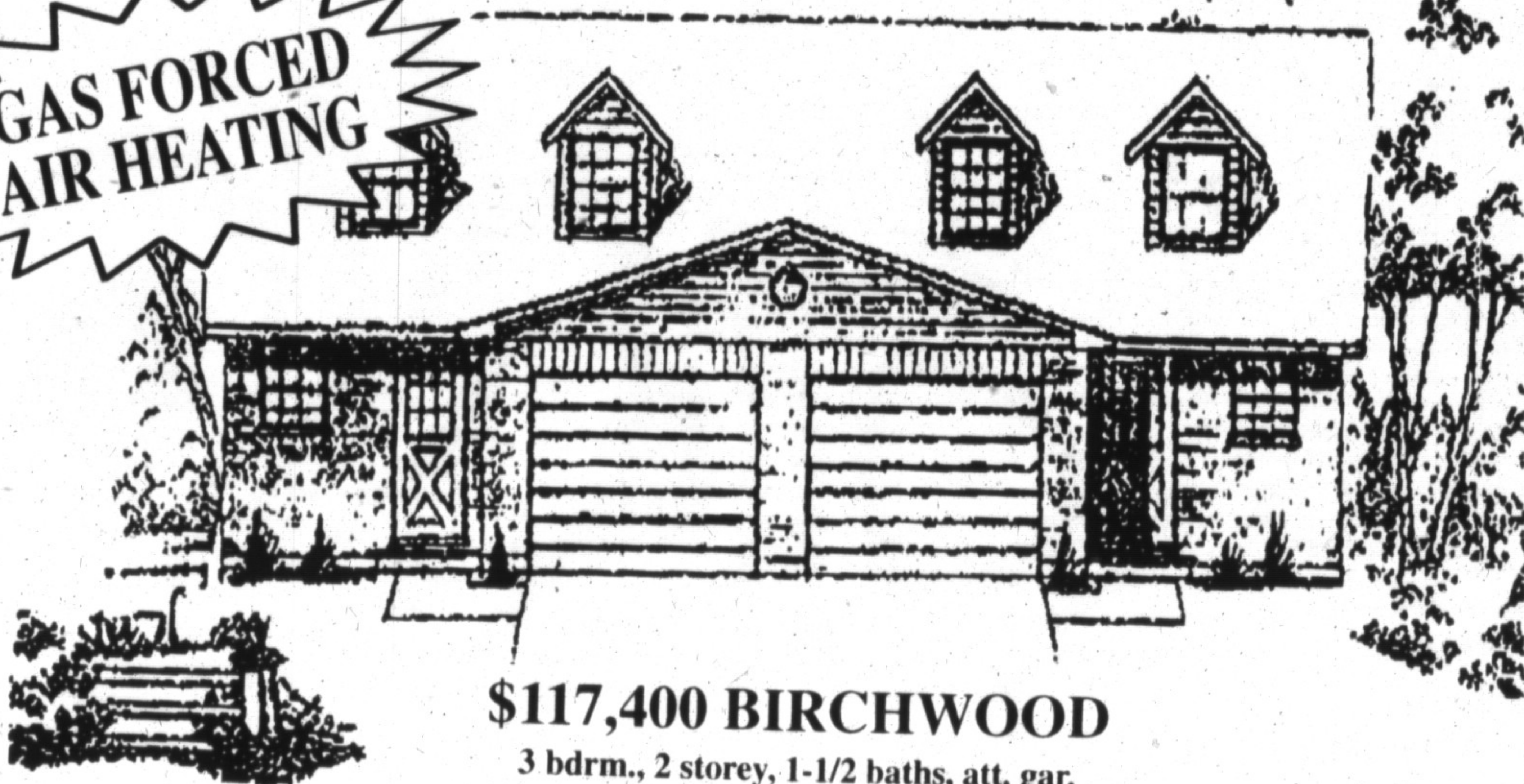
$117,400 BIRCHWOOD 3 bdrm., 2 storey, 1-1/2 baths, att. gar.