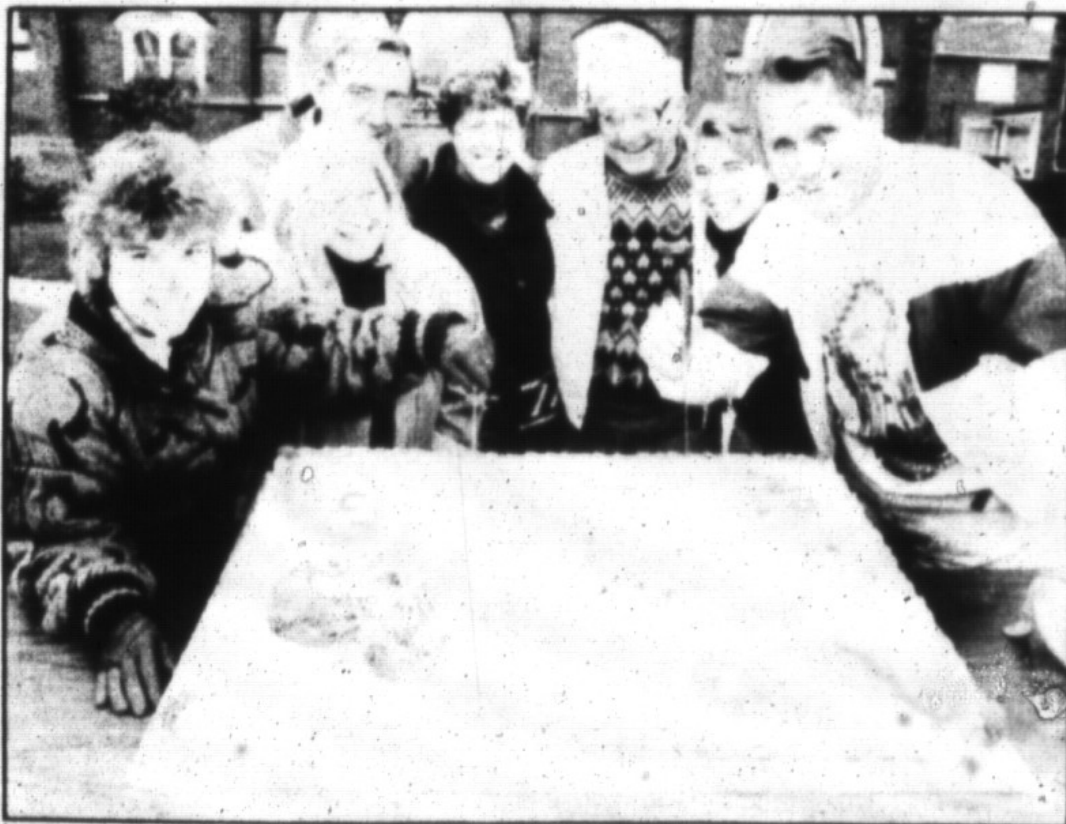
The Milton Farmers Market has been serving the town fresh produce for 20 years and its birthday was marked in October when the Main Street market closed for the season.