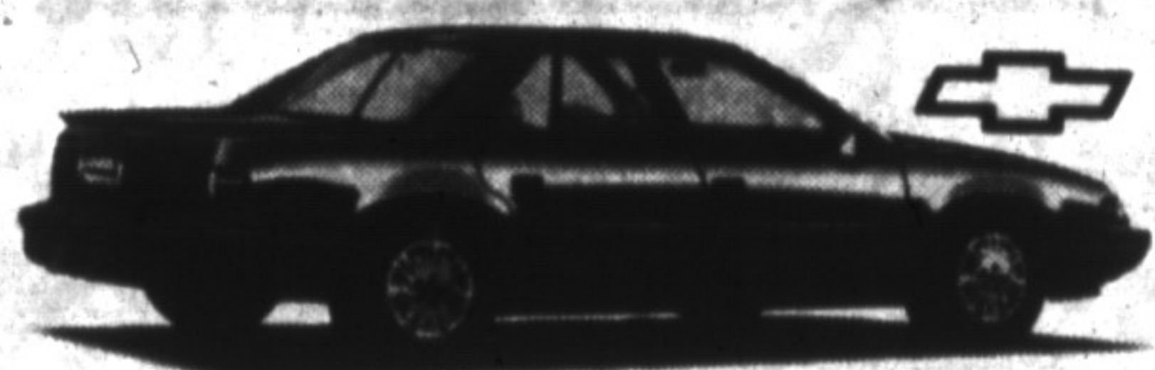
1992 CHEVROLET including Lumina (shown), Cavalier, Corsica, Beretta, Caprice & Lumina APV.

PRIME CUT TIME OUR HOTTEST BOXING WEEK SALE EVER!