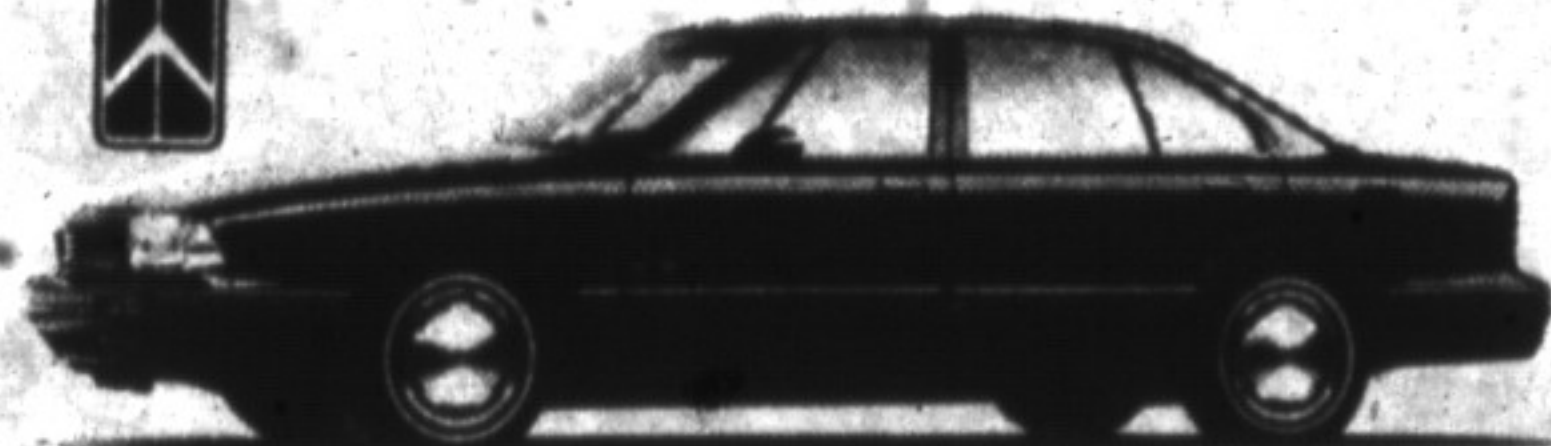
1992 OLDSMOBILE including Olds 88 (shown), Ciera, Achieva and Cutlass.