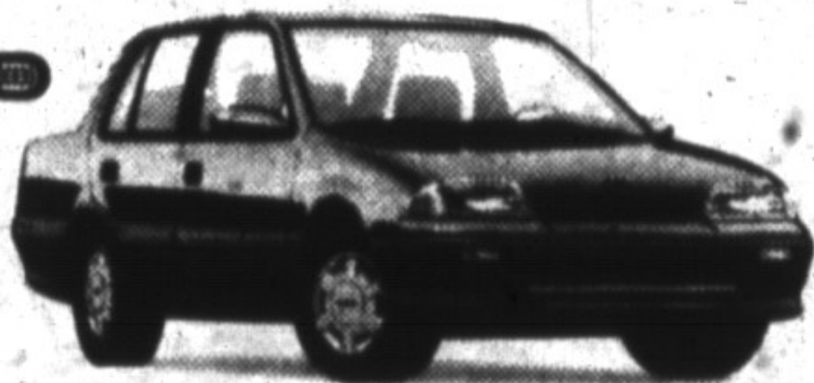
1992 GEO including Metro (shown), Storm & Tracker.