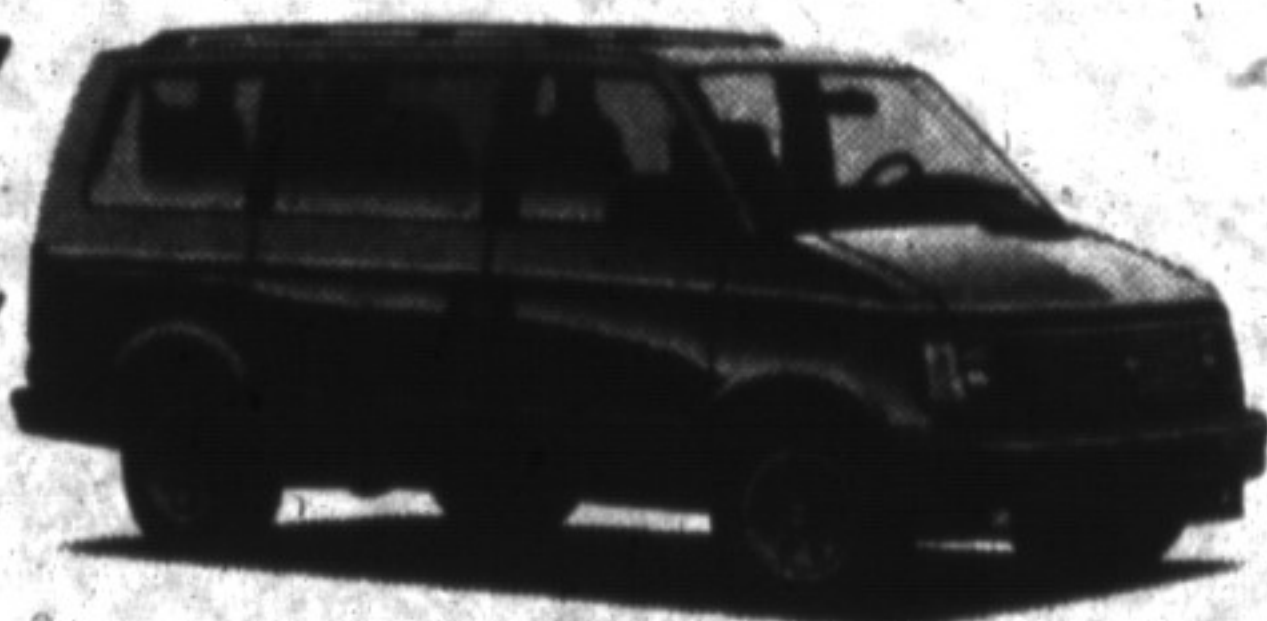
1992 CHEVY TRUCKS including Astro van (shown), Blazer, plus Full-Size and Compact Pickups.