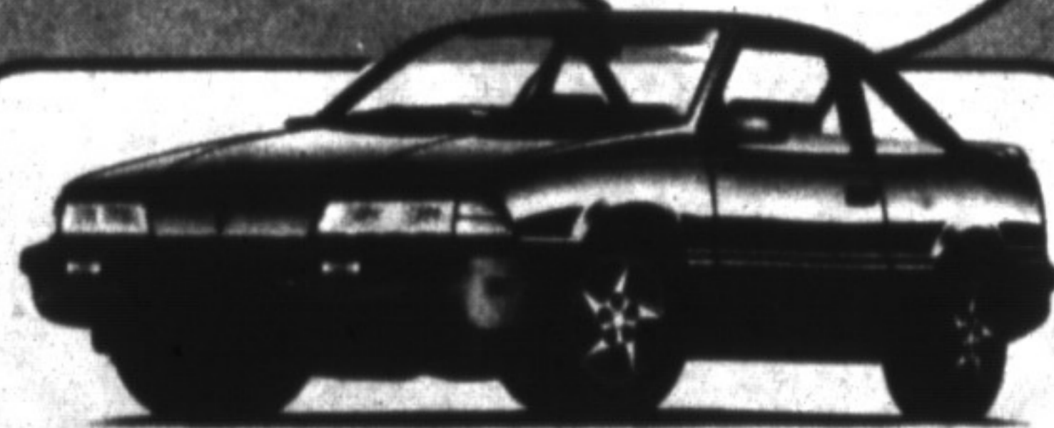
'93 SUNBIRD LE

2 door coupe, sport mirror, trunk release, AM/FM ETR stereo, anti-lock brakes, daytime running lights. Stk. # 1828