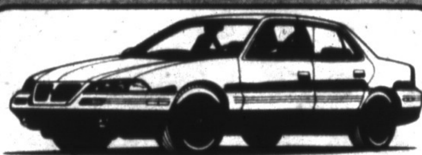
'92 GRAND AM SE 4 DOOR

Air conditioning, V-6 engine, AM/FM stereo cass., anti-lock brakes, power windows, power door locks, alum. wheels, Eagle tires. Stk. # 1647