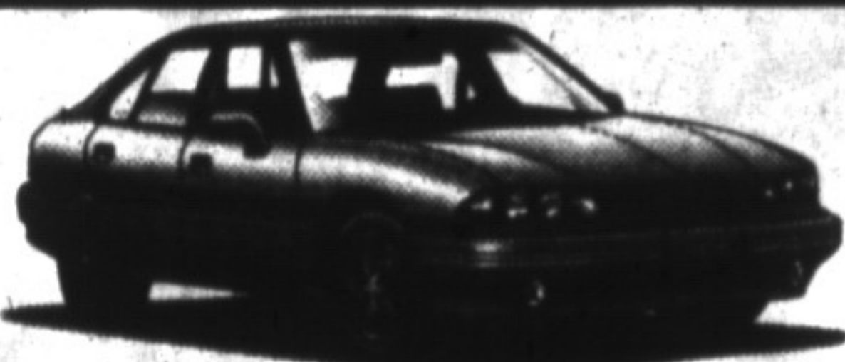
'92 BONNEVILLE LE

Air conditioning, 3.8 L V-6 engine, AM/FM stereo cass., deluxe gauge pkg., power windows, power door locks, auto O.D. trans. Stk. # 1699.