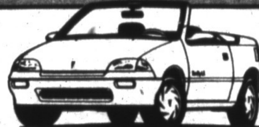
'91 FIREFLY CONVERTIBLE

Pulse wipers, appearance pkg., AM/FM stereo, 5 spd. trans., cassette, folding convert. top. Stk. # 1070