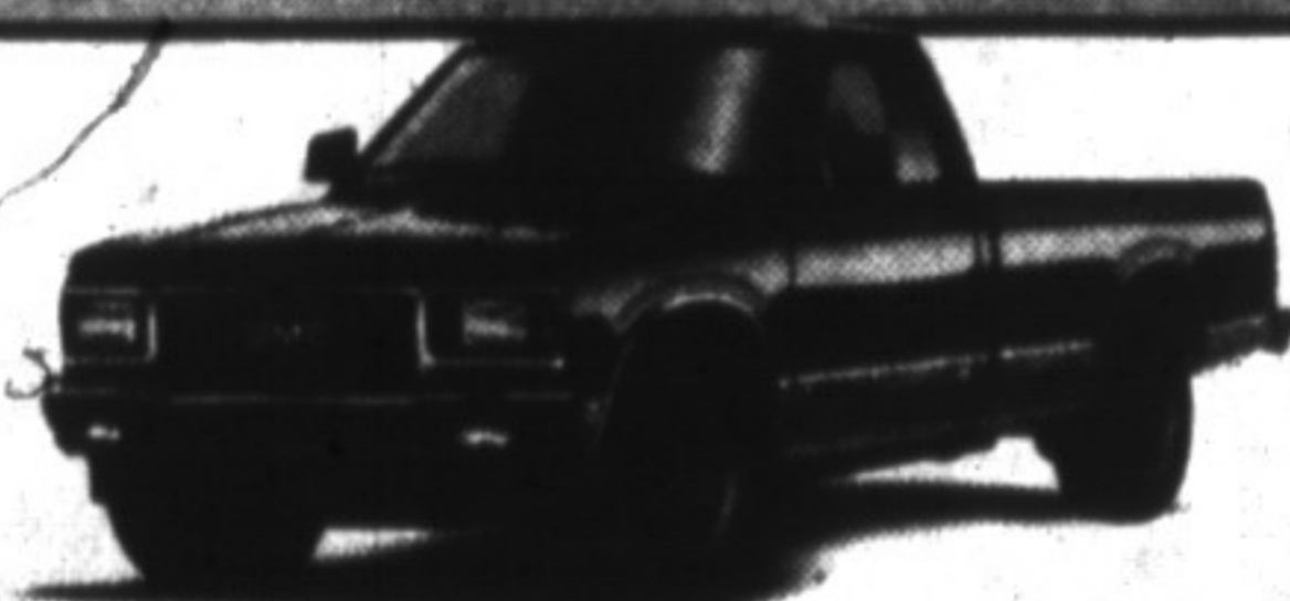
'92 SONOMA PICK-UP

Loaded with V-6 engine, high back bucket seats, AM/FM stereo cass., stripe pkg., sliding rear window, alum. wheels, H. D. Suspension. Stk. # 1260.