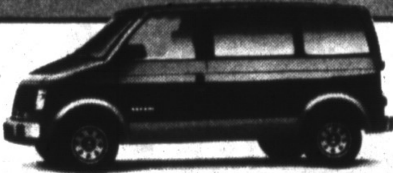
'92 SAFARI PASSENGER VAN

Loaded with air conditioning, power windows, & door locks, anti-lock brakes, AM/FM stereo cass., rally wheels, 8 passenger seating, roof racks, deluxe counsel. Stk. # 1512