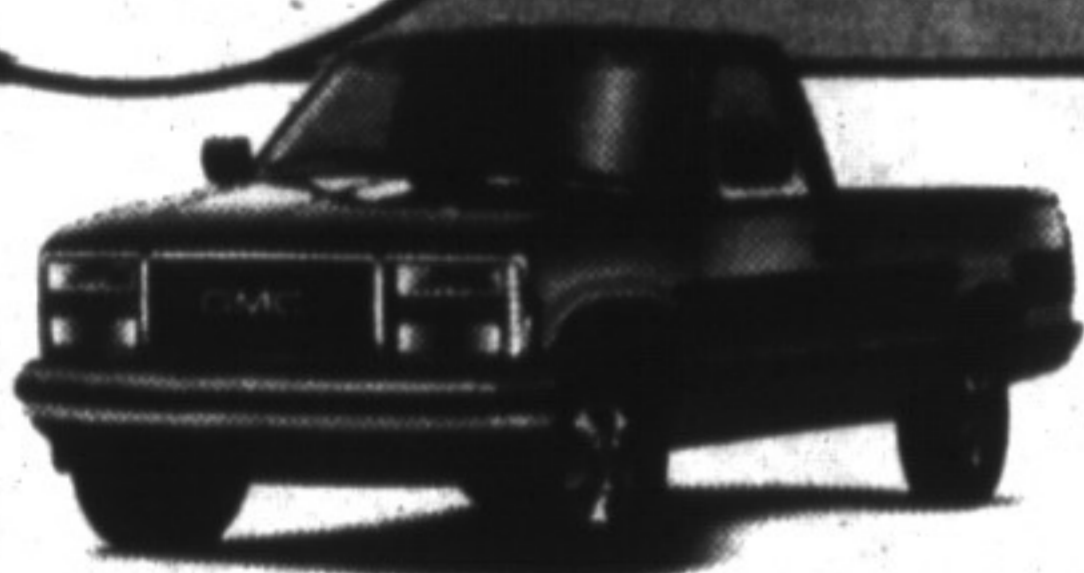
'93 GMC FULL SIZE PICK-UP

Sierra Special Pkg., cloth seats, chrome front bumper, sliding rear window, tinted glass, rear step bumper, bed liner, ETR radio. Stk. # 1827.