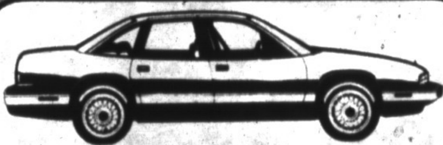
'92 REGAL LIMITED

Company demonstrator, 3.8 L V6 eng., anti-lock brakes, keyless entry, extended range sound sys., dual zone air cond., power windows & locks, front buckets w. counsel, alum. wheels. St. # 1467